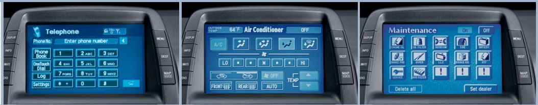
Multi-information display with hands-free phone screen with Bluetooth™ technology/air conditioning/maintenance screen.