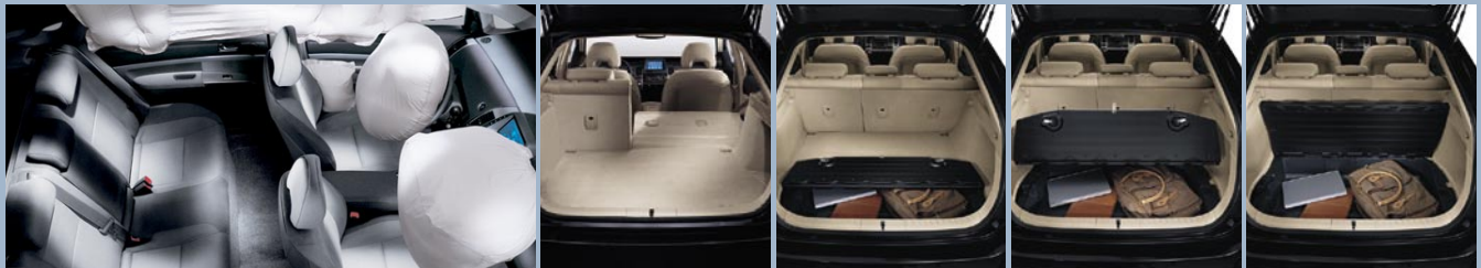
Driver and front passenger dual-stage airbags 1 and available front seat-mounted side and front and rear side curtain airbags. 1