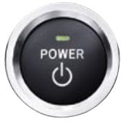
Power on/off button.