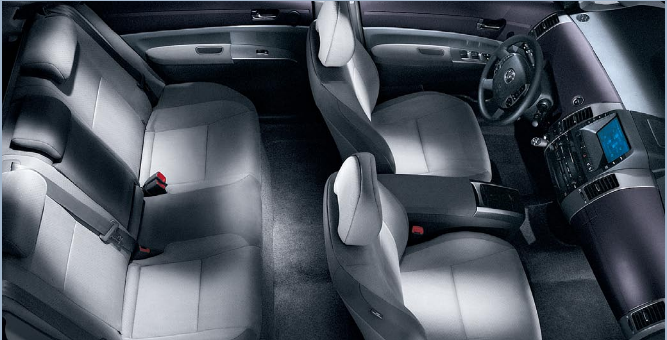
Prius interior shown in Gray/Burgundy with available Package #6