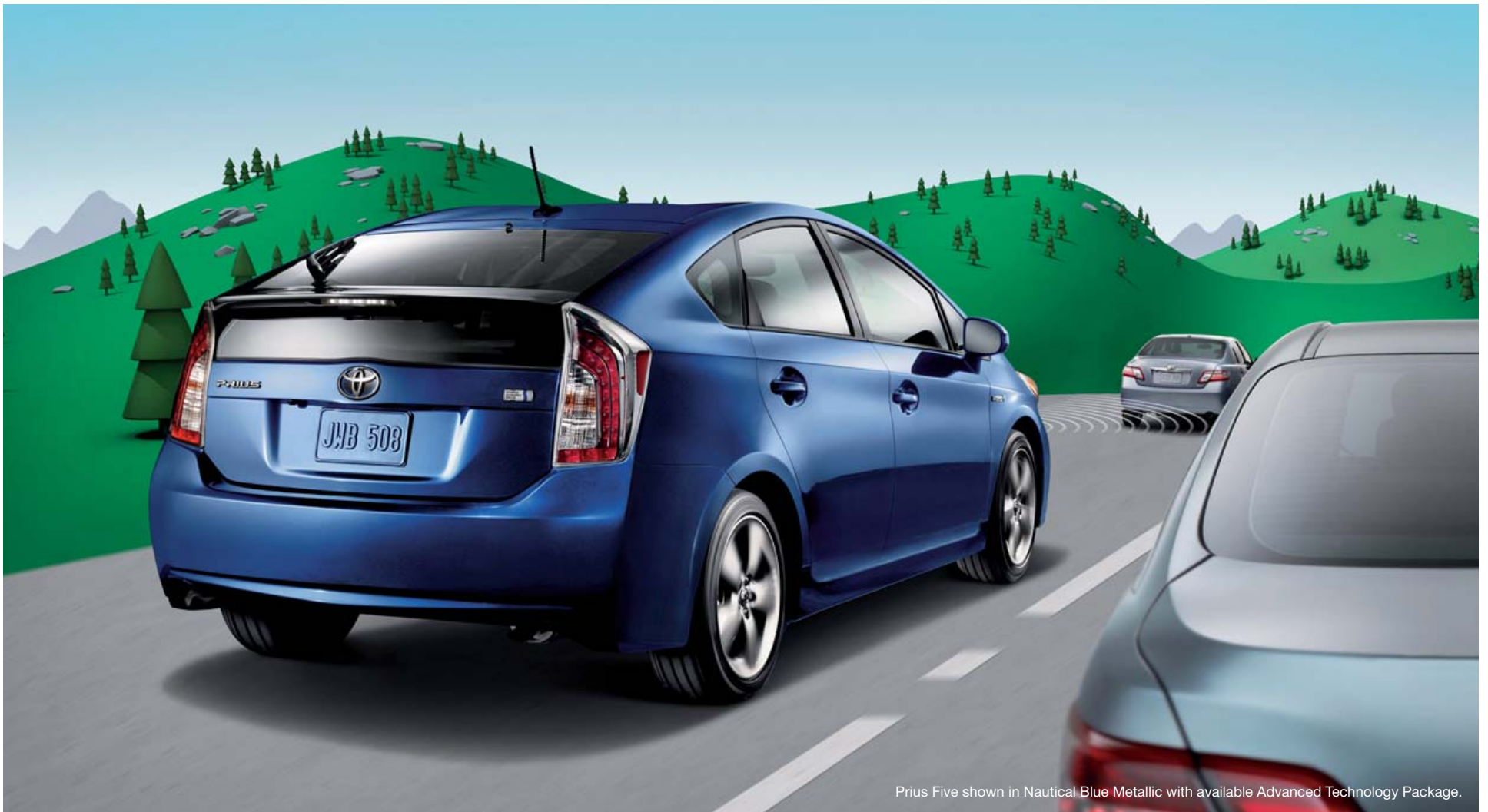
Prius Five shown in Nautical Blue Metallic with available Advanced Technology Package.