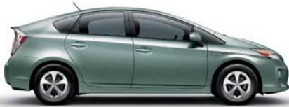
SEA GLASS PEARL