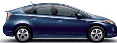
NAUTICAL BLUE METALLIC