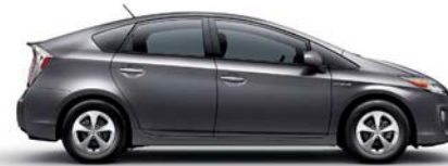
WINTER GRAY METALLIC