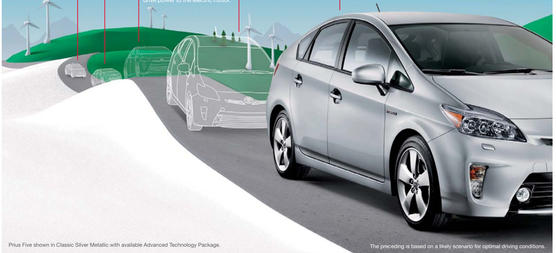
Prius Five shown in Classic Silver Metallic with available Advanced Technology Package.

GASOLINE ENGINE The series-parallel Hybrid Synergy Drive® helps the gasoline engine deliver both power and fuel efficiency.