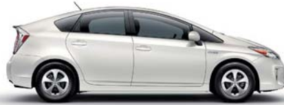
BLIZZARD PEARL (extra-cost color)