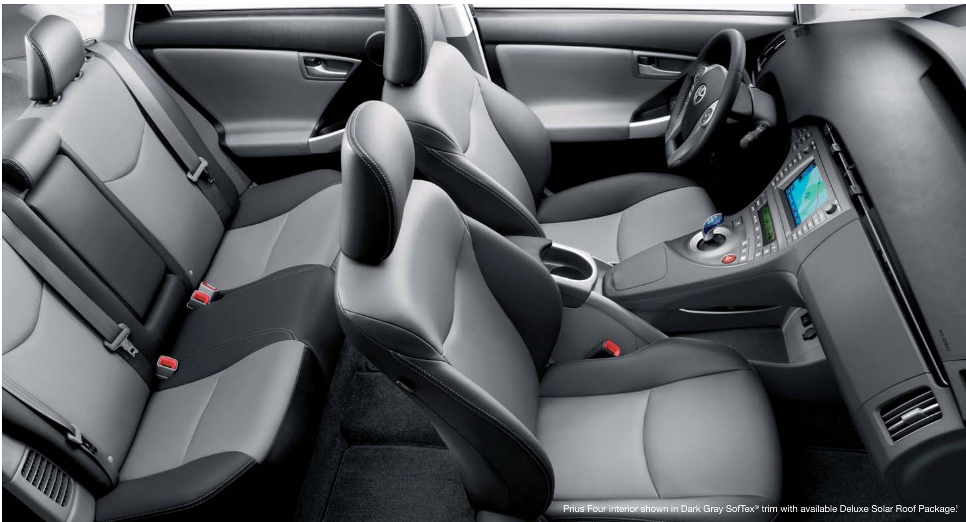
Prius Four interior shown in Dark Gray SofTex® trim with available Deluxe Solar Roof Package!

Getting comfortable is easy, thanks to the available 8-way power-adjustable driver's seat with power lumbar support that lets you find your ideal position.