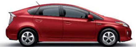
BARCELONA RED METALLIC