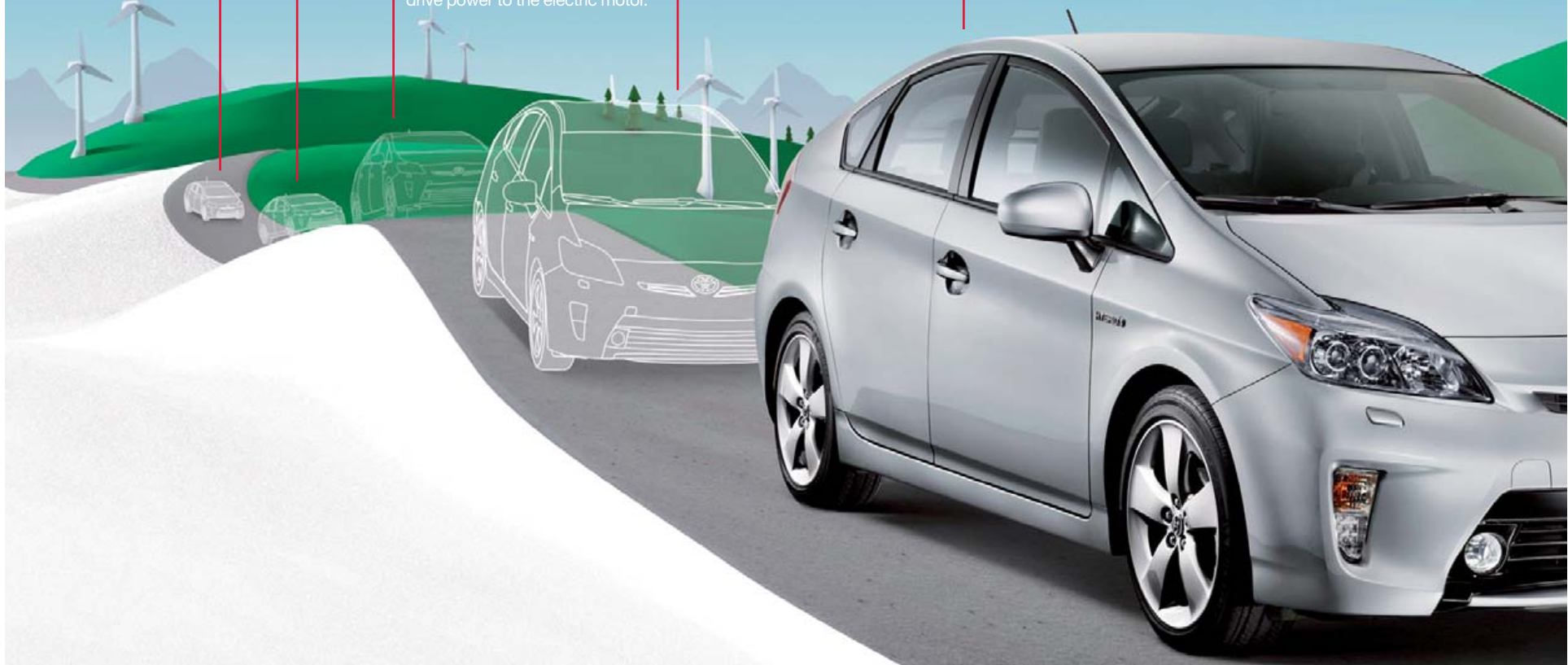
Prius Five shown in Classic Silver Metallic with available Advanced Technology Package.

GASOLINE ENGINE The series-parallel Hybrid Synergy Drive® helps the gasoline engine deliver both power and fuel efficiency.