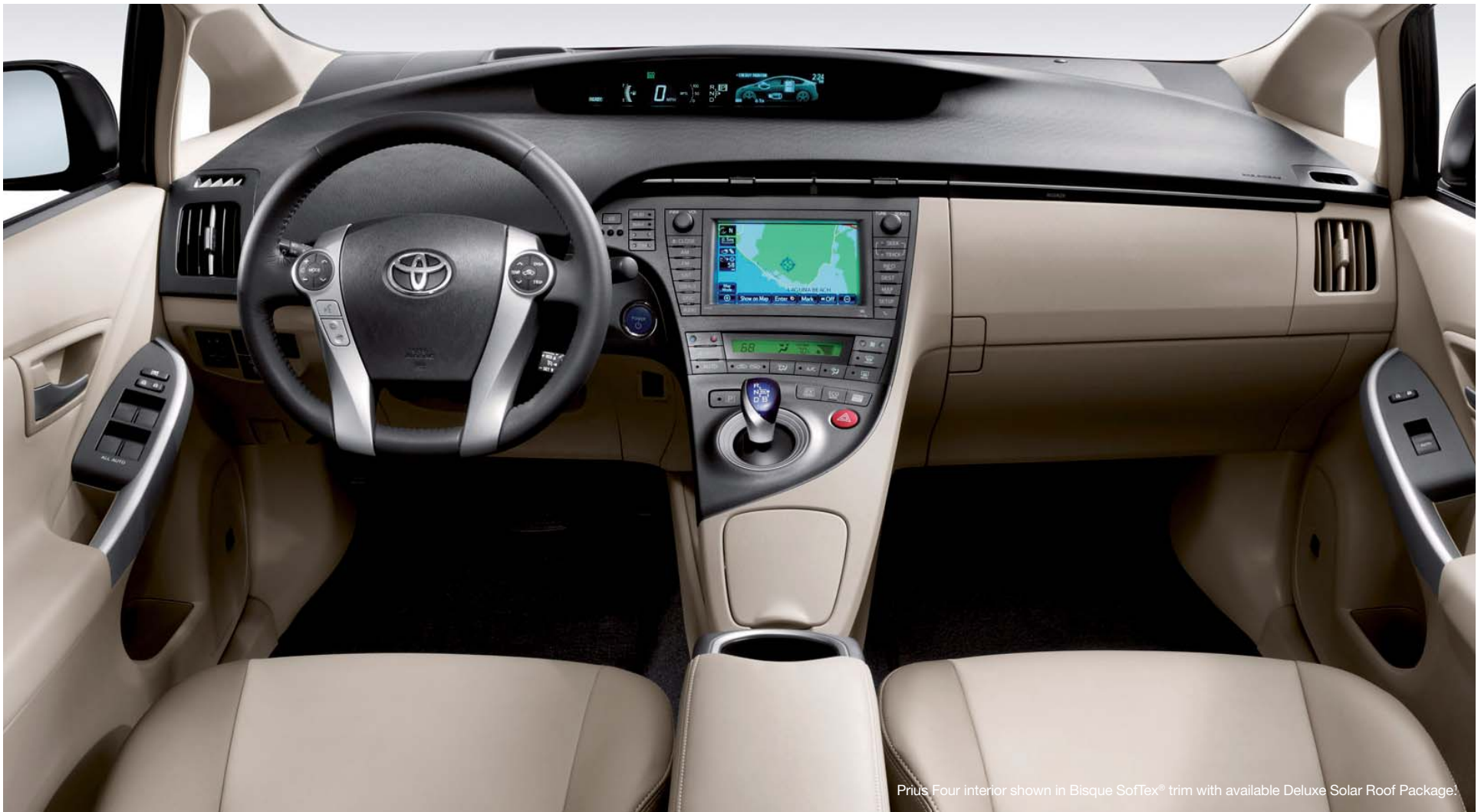
Prius Four interior shown in Bisque SofTex® trim with available Deluxe Solar Roof Package!

1. See footnote 2 in Disclosures section.