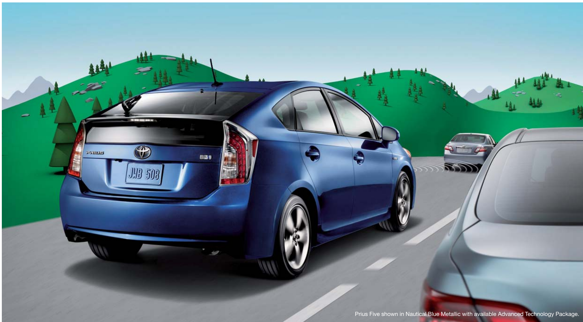
Prius Five shown in Nautical Blue Metallic with available Advanced Technology Package.