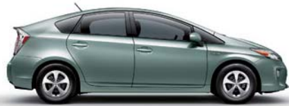
SEA GLASS PEARL