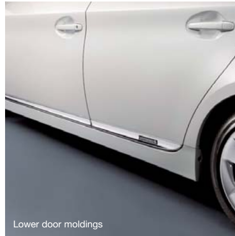
Lower door moldings