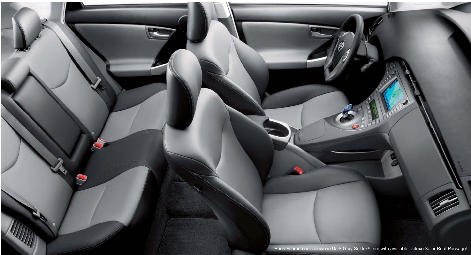
Prius Four interior shown in Dark Gray SofTex® trim with available Deluxe Solar Roof Package!

Getting comfortable is easy, thanks to the available 8-way power-adjustable driver's seat with power lumbar support that lets you find your ideal position.