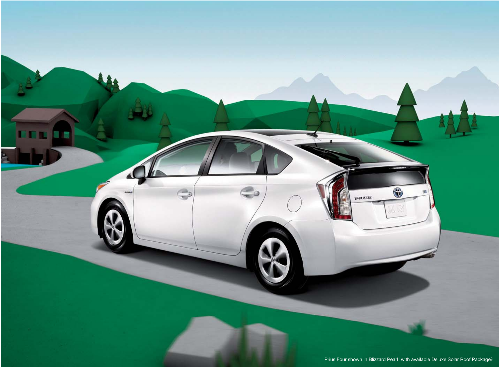
Prius Four shown in Blizzard Pearl 1 with available Deluxe Solar Roof Package 2