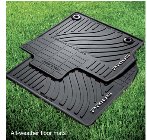
All-weather floor mats 10