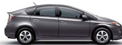
WINTER GRAY METALLIC