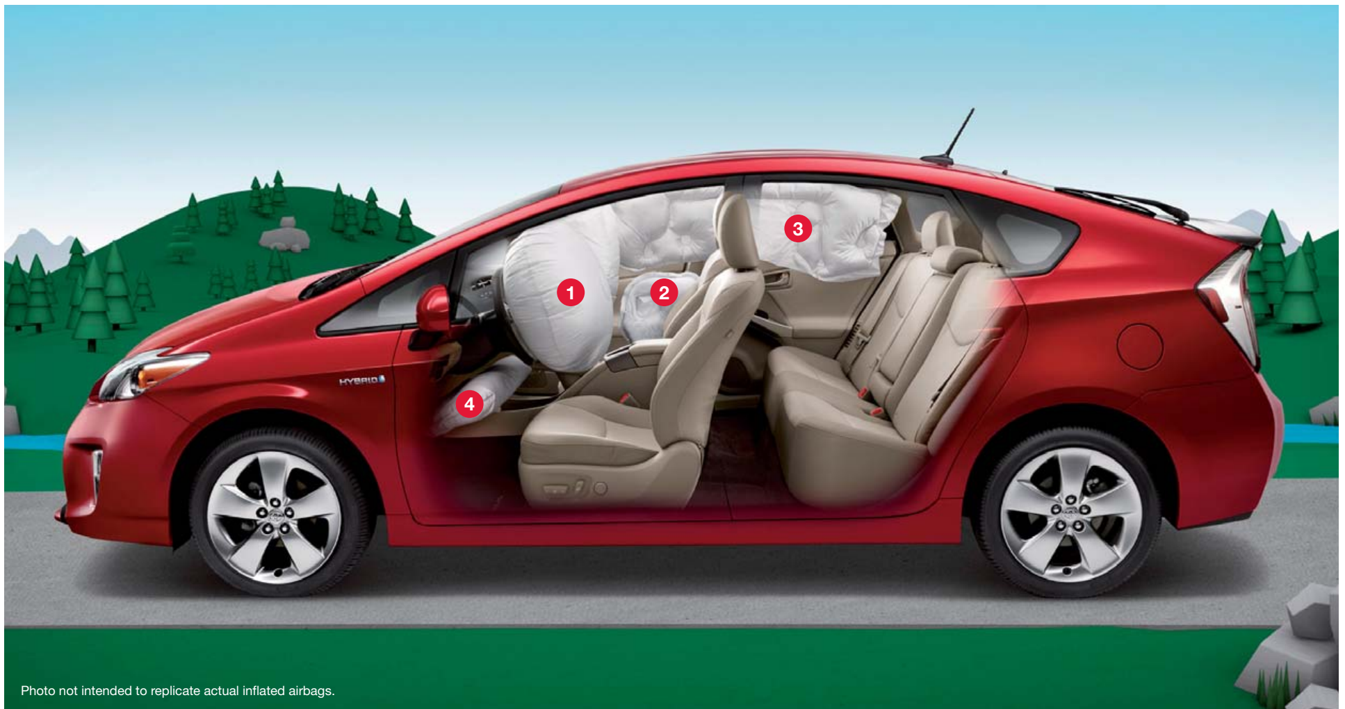
Photo not intended to replicate actual inflated airbags.

This airbag does more than its name suggests. In the event of a frontal collision, it can also help reduce the force on the chest and abdomen.