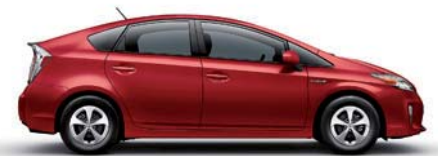
BARCELONA RED METALLIC