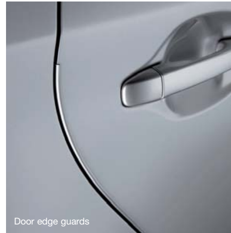
Door edge guards