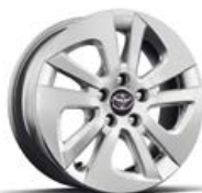
ONE 15-in. 5-spoke alloy wheels with full wheel covers