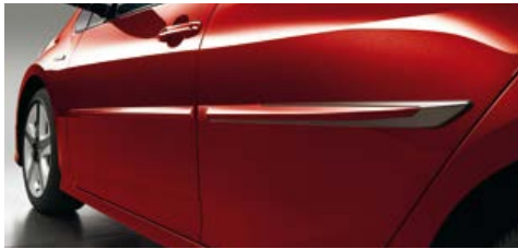
Body side moldings

Rear bumper appliqué Rear bumper protector Universal tablet holder