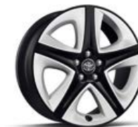
THREE Touring and FOUR Touring 17-in. 5-spoke alloy wheels