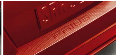
Rear bumper appliqué