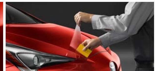
Paint protection film 20

See numbered footnotes in Disclosures section.