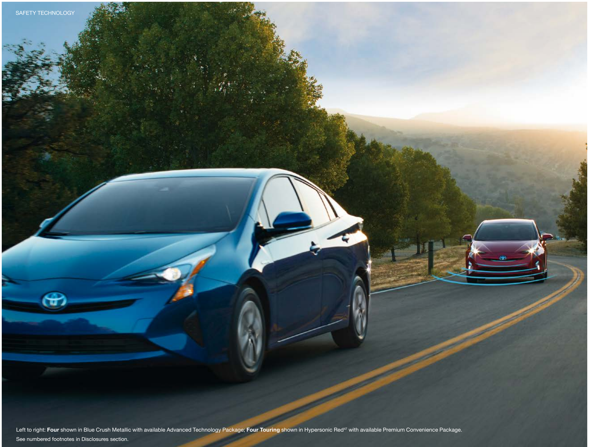
Left to right: Four shown in Blue Crush Metallic with available Advanced Technology Package; Four Touring shown in Hypersonic Red 47 with available Premium Convenience Package. See numbered footnotes in Disclosures section.