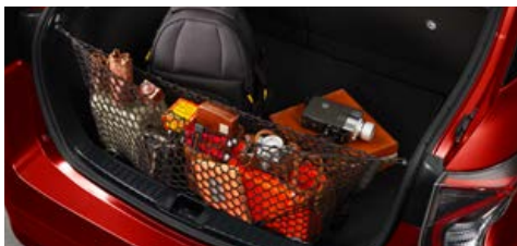
Cargo net — envelope 44