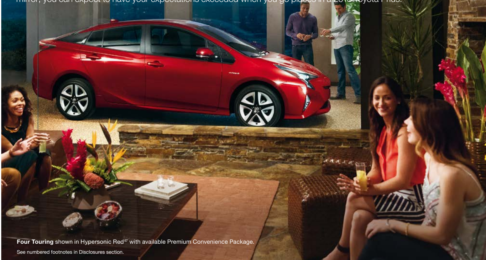
Four Touring shown in Hypersonic Red 47 with available Premium Convenience Package.

Since launching, the Toyota Prius has led by example on a global scale. Prius is everyone's hybrid — a shining symbol of ingenuity, universality and, most of all, fun. This iconic ride has always stood for something important, and the 2018 Prius is no different. Prius owners everywhere can continue going more places in style and comfort while still thinking environmentally. Enjoy peace of mind with the standard suite of Toyota Safety Sense™ P (TSS-P) 29 features, including Lane Departure Alert with Steering Assist (LDA w/SA). 32 Stay focused on the road ahead and tuned in to the apps you need with an impressive, available 11.6-in. HD multimedia display, complete with familiar pinch, zoom and tap capabilities. The instantly recognizable aerodynamic design of Prius goes beyond sleek styling to offer you an exhilarating, reliable and efficient drive. It's got nearly two decades of excellence in its rearview mirror; you can expect to have your expectations exceeded when you go places in a 2018 Toyota Prius.