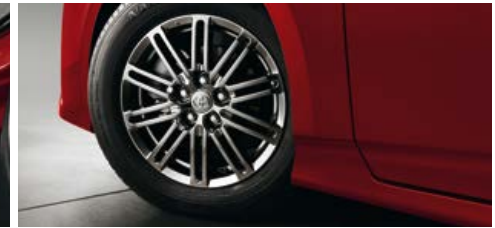
15-in. "Hyper Black" 10-spoke alloy wheels