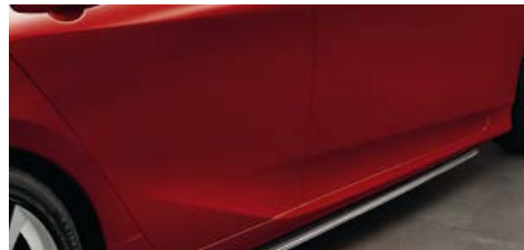
Aero side splitters