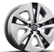
TWO, TWO Eco, THREE and FOUR 15-in. 5-spoke alloy wheels with two-tone wheel covers