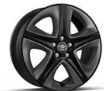
THREE and FOUR Touring 17-in. 5-spoke alloy wheels with gunmetal wheel inserts (available with Appearance Package)