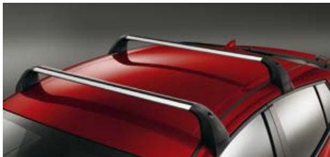
Cargo cross bars