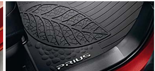
All-weather floor liners 48