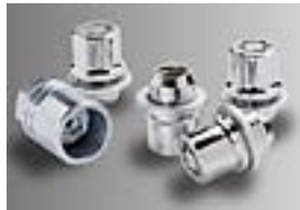
Alloy Wheel Locks $81.00 Installed MSRP*