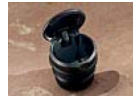
Ashtray Cup $17.00 Parts Only MSRP**