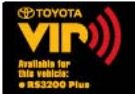
VIP Security System RS3200 Plus $359.00 Installed MSRP*