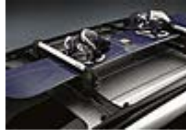
Ski Attachment with Adapters $194.00 Parts Only MSRP**