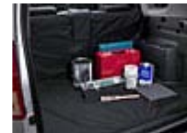
Cargo Liner $139.00 Installed MSRP*