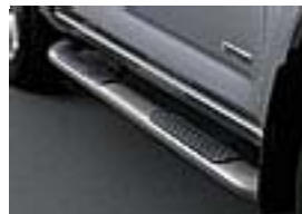
Tube Steps $450.00 Installed MSRP*