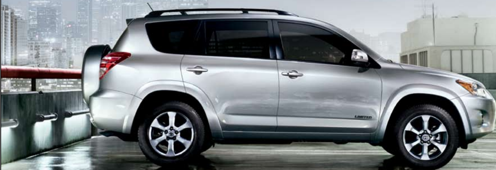
Limited V6 shown in Classic Silver Metallic