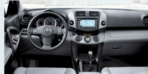
Limited interior shown in Ash with available Premium Package and touch-screen DVD navigation system [10]