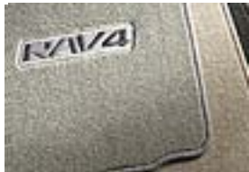
Carpet Floor Mats/Cargo Mat w/o 3rd Row Seat $199.00 w/ 3rd Row Seat $109.00 Installed MSRP*