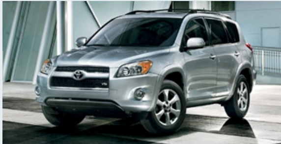
Limited V6 shown in Classic Silver Metallic