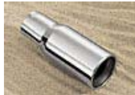
Exhaust Tip $75.00 Installed MSRP*