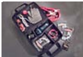
Emergency Assistance Kit $70.00 Installed MSRP*