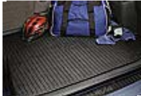
Cargo Tray $109.00 Installed MSRP*