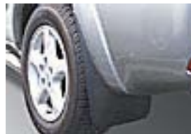
Mudguards $99.00 Installed MSRP*