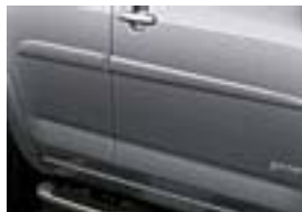
Body Side Moldings $199.00 Parts Only MSRP**