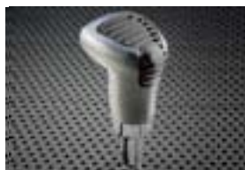
Shift Knob $75.00 Installed MSRP*