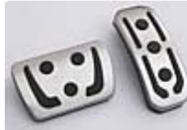
Sport Pedals $85.00 Installed MSRP**