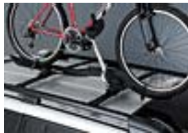
Bike Attachment with Adapters $244.00 Parts Only MSRP**