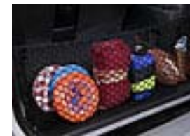
Cargo Net $49.00 Installed MSRP*