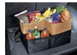
Cargo Tote $40.00 Installed MSRP*