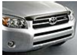
Hood Protector $135.00 Installed MSRP*