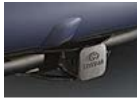
Towing Receiver Hitch w/o Tow Package - $750.00 w/ Tow Package - $820.00 Installed MSRP*