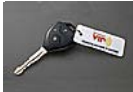
Remote Start $529.00 Installed MSRP*