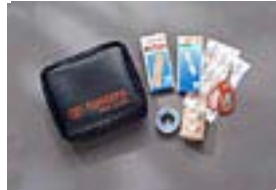
First Aid Kit $29.00 Installed MSRP*