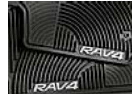
All Weather Mats $99.00 Parts Only MSRP**