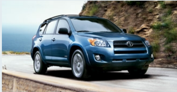
Sport shown in Pacific Blue Metallic