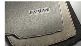
Carpet Floor Mats/Cargo Mat $199 Installed MSRP*