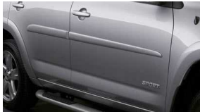
Body Side Moldings $199 Installed MSRP*