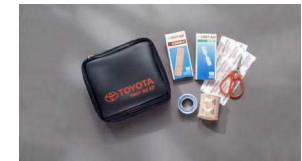
First Aid Kit $29 Installed MSRP*