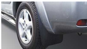
Mudguard $99 Installed MSRP*