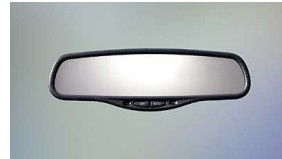
Auto Dimming Mirror $330 Installed MSRP*