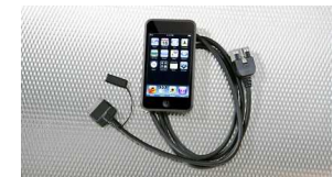
iPod® Interface $299 Installed MSRP*