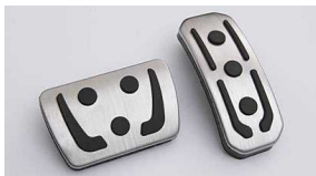
Sport Pedals by OBX Racing $85 Installed MSRP*