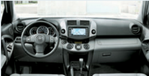
Limited interior shown in Ash with available Premium Package and touch-screen DVD navigation system [12]