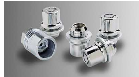
Wheel locks $81 Installed MSRP*