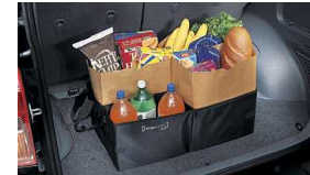
Cargo Tote $40 Installed MSRP*