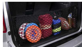
Cargo Net $49 Installed MSRP*