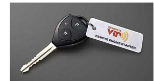
Remote Start $529 Installed MSRP*