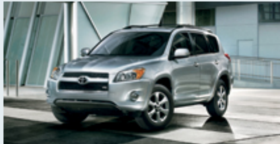
Limited V6 shown in Classic Silver Metallic