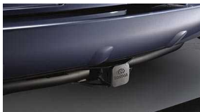
Towing Receiver Hitch without Tow Package $750 Installed MSRP*