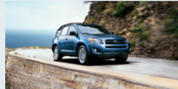
Sport shown in Pacific Blue Metallic