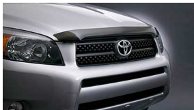
Hood Protector $135 Installed MSRP*