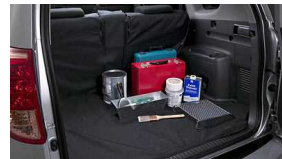
Cargo Liner $139 Installed MSRP*