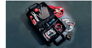
Emergency Assistance Kit $70 Installed MSRP*