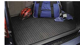
Cargo Tray $109 Installed MSRP*