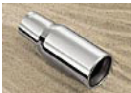
Exhaust Tip by Valor