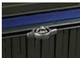
Cleat Tie Down