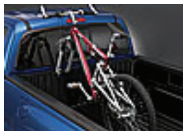
Fork Mount Bike Attachment