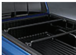
Cargo Cross Bars