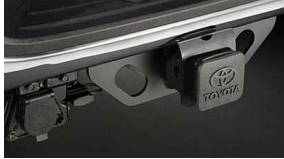
Tow Hitch w/ 7 Pin Connector $920 Installed MSRP*