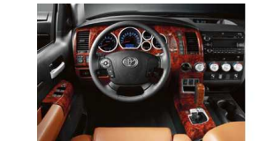
Molded Simulated Burlwood Dash Applique by Superior Dash $350 Installed MSRP*