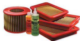
TRD Performance Air Filter $90 Installed MSRP*