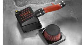
TRD Performance Air Intake $475 Parts Only MSRP**