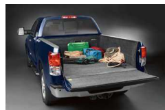
Bed Rug Long Bed $419 Parts Only MSRP** Regular Bed $434 Parts Only MSRP**