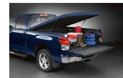
Tonneau Cover $1,575 Installed MSRP*