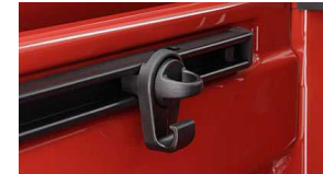
Mini Tie Down w/Hook (set of 2) $45 Installed MSRP*