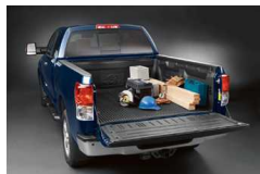
Bedliner w/Deck Rail System Long Bed $395 Installed MSRP* Regular Bed $365 Installed MSRP*