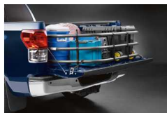
Bed Extender $320 Installed MSRP*