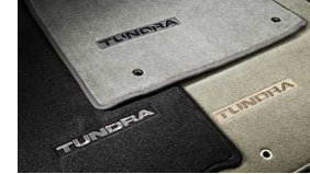
Carpet Floor Mats $115 Installed MSRP*