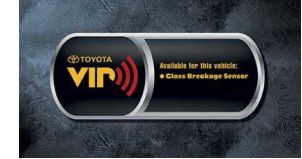
Glass Breakage Sensor (GBS) $165 Installed MSRP*