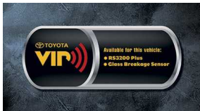
VIP-RS3000 Plus Security System $299 Installed MSRP*