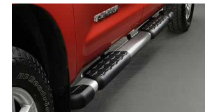
Stepboards Brushed Stainless Steel $624 Installed MSRP*