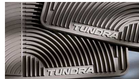
All Weather Mat $99 Installed MSRP*