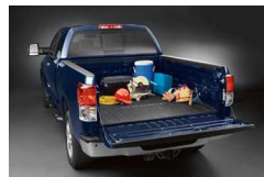
Bed Mat Long Bed $137 Installed MSRP* Regular Bed $137 Installed MSRP*