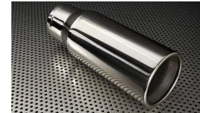
Exhaust Tip $85 Installed MSRP*