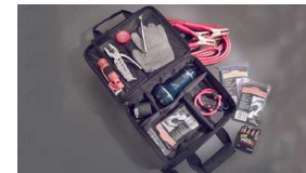
Emergency Assistance Kit $70 Installed MSRP*