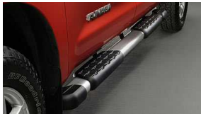
TRD 17" x 8" 6 Split Spoke Forged Off-road Wheel w/ Beadlock Styling $624 Installed MSRP*