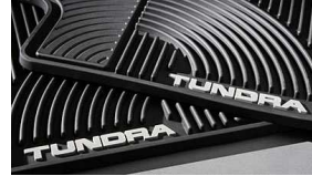
All Weather Floor Mats w/ Door Sill Protector $162 Installed MSRP*