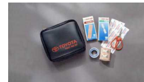
First Aid Kit $29 Installed MSRP*