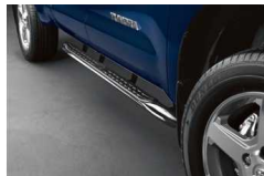
Tube Steps - Chrome $534 Installed MSRP*