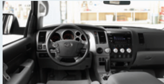
Double Cab Tundra interior shown in Graphite.