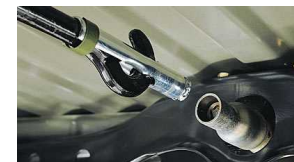
Spare Tire Lock $73 Installed MSRP*