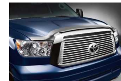
Hood Protector $165 Installed MSRP*