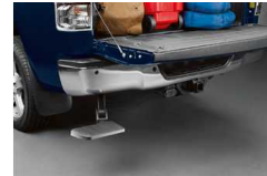
Bed Step $300 Installed MSRP*