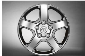
20" Machined Star 5 Spoke Wheel $1,695 Installed MSRP*