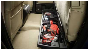
Underseat Storage $125 Installed MSRP*