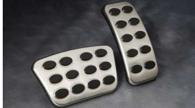
Sport Pedal Stainless Steel $85 Installed MSRP*