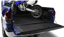
Bedliner w/o Deck Rail System Long Bed $375 Installed MSRP* Regular Bed $345 Installed MSRP*