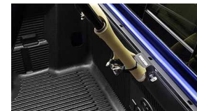
Locking Bike Fork Attachment $95 Installed MSRP*