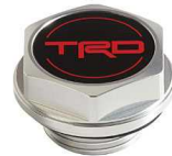
TRD Forged Oil Cap $45 Parts Only MSRP**