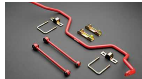
TRD Rear Sway Bar $299 Installed MSRP*