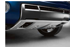
Front Skid Plate $425 Installed MSRP*