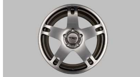
TRD 22"x9" 5-Spoke Polished Forged Aluminum Alloy Wheel $4,699 Installed MSRP*