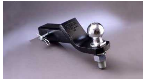
Ball Mounts $65 Parts Only MSRP**