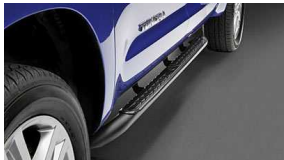
Tube Steps - Black $490 Installed MSRP*