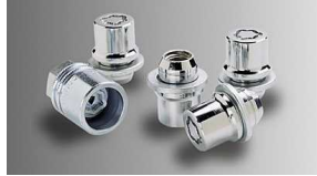
Wheel Locks $81 Installed MSRP*