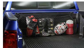
Cargo Net Exterior $49 Installed MSRP*