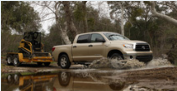
4x4 Crewmax Tundra shown in Sandy Beach Metallic with available 4.6L V8, fog lamps and 18-inch alloy wheels.