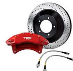
TRD High Performance Brake Kit $2,895 Installed MSRP*