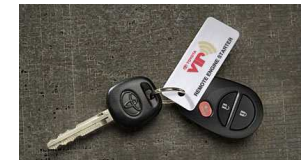
Remote Engine Start $529 Installed MSRP*