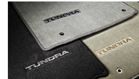
Carpet Floor Mats w/Door Sill Protector $178 Installed MSRP*