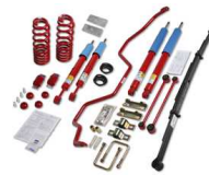
TRD Performance Handling Kit $1,699 Installed MSRP*