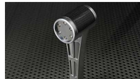
Anodized Aluminum Shift Knob $85 Installed MSRP*