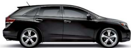
ATTITUDE BLACK METALLIC