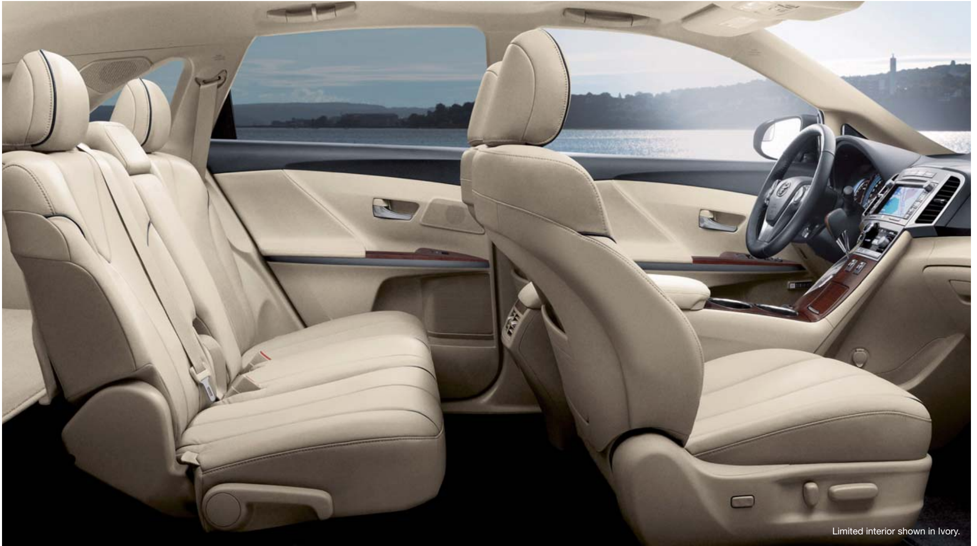
Limited interior shown in Ivory.

With its thoughtful design and attention to craftsmanship, Venza is a truly remarkable blend of comfort, style and versatility.