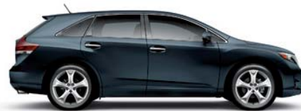
COSMIC GRAY MICA