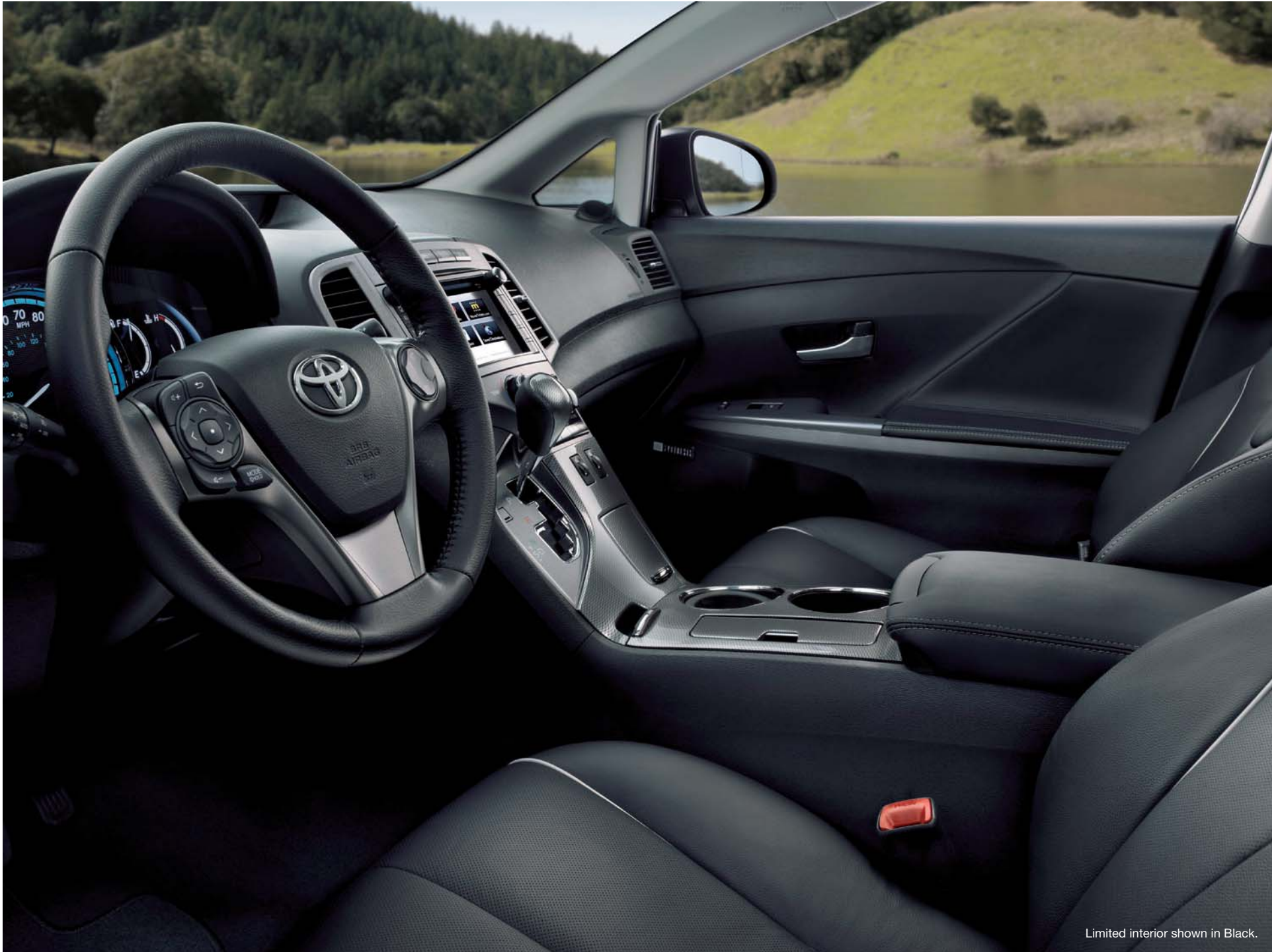
Limited interior shown in Black.