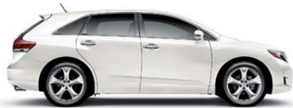
BLIZZARD PEARL 1