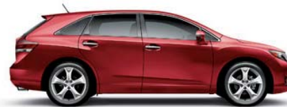
BARCELONA RED METALLIC