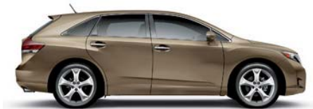
GOLDEN UMBER MICA