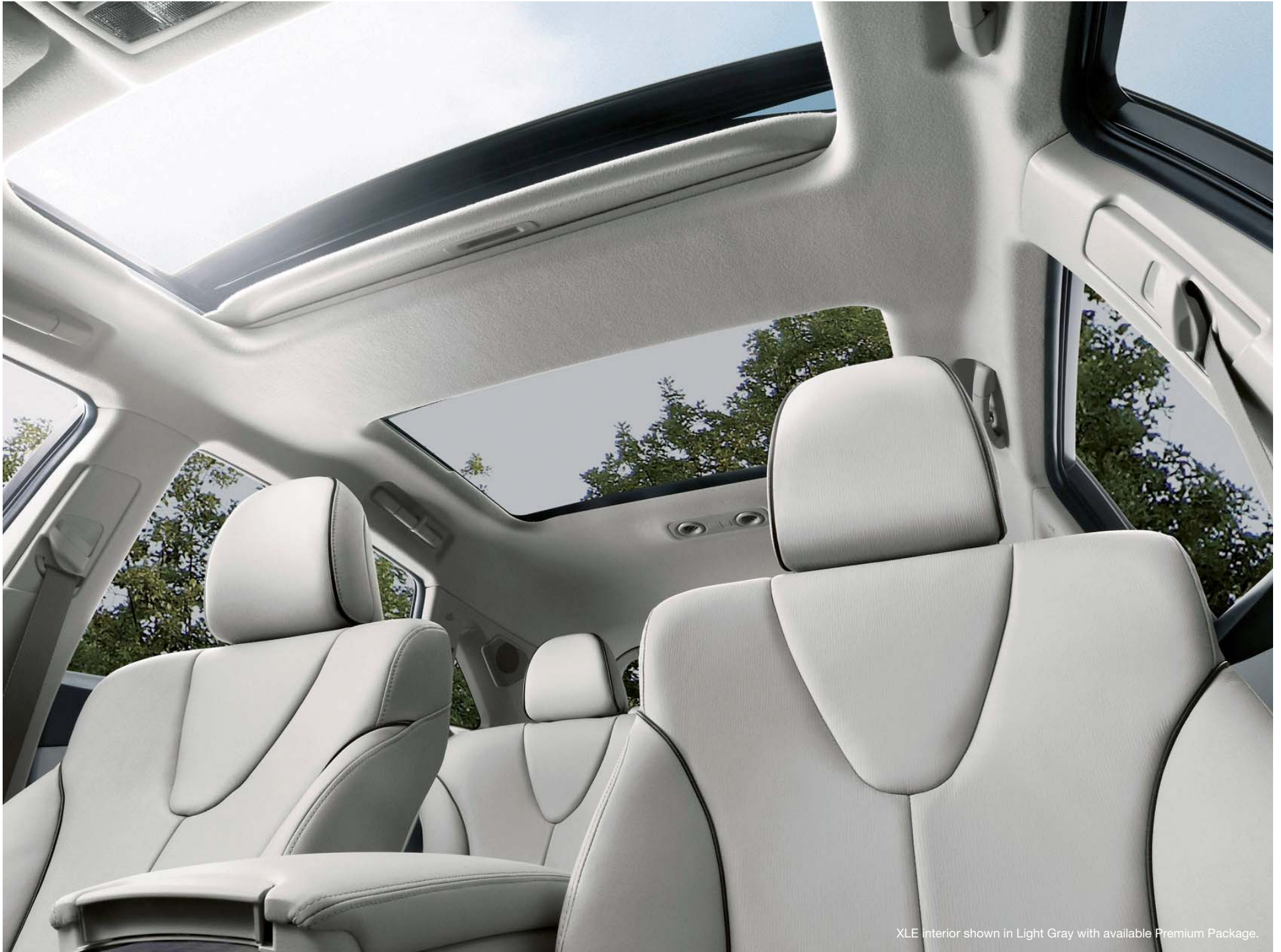
XLE interior shown in Light Gray with available Premium Package.