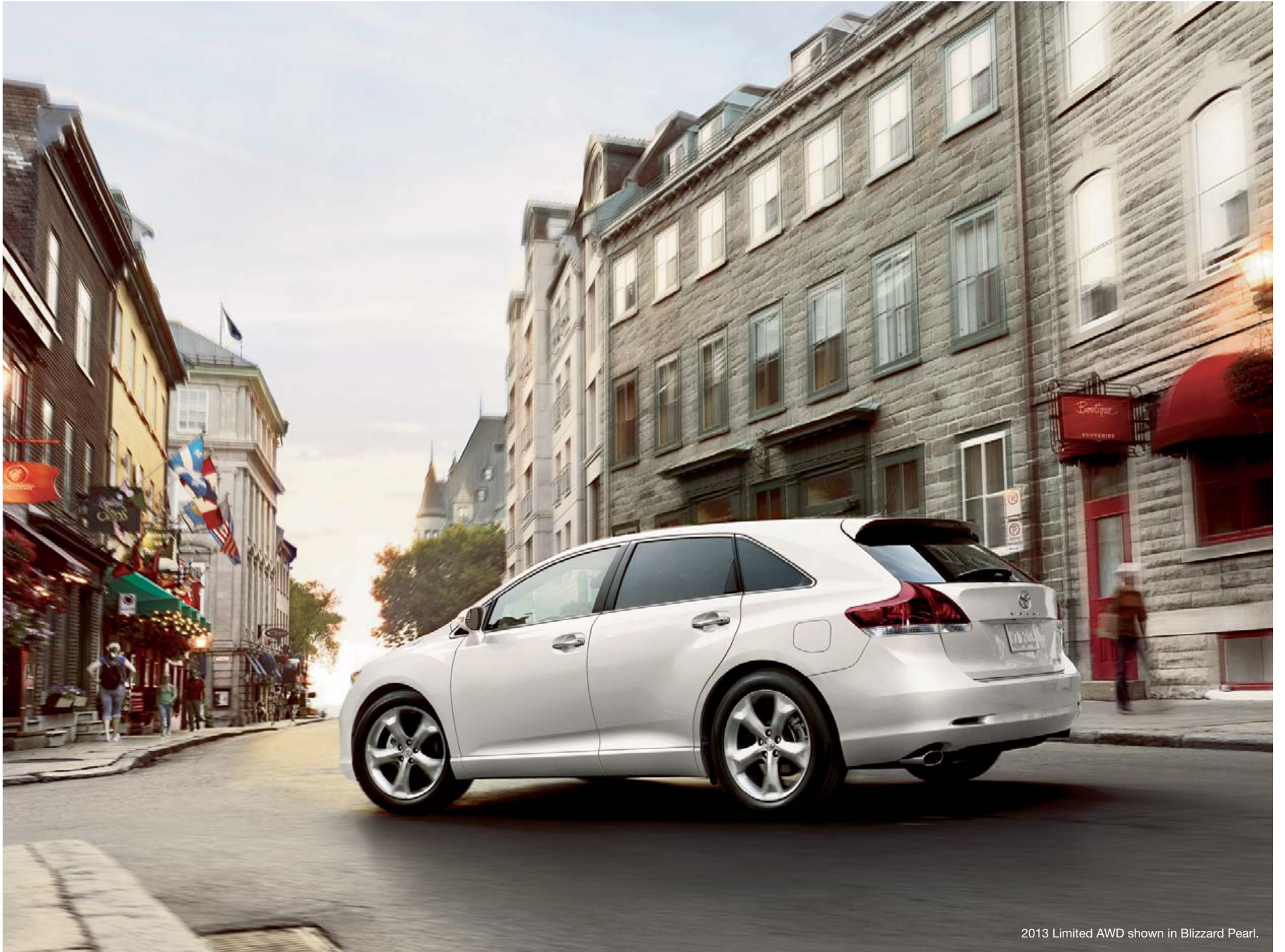
2013 Limited AWD shown in Blizzard Pearl.