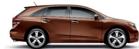
SUNSET BRONZE MICA