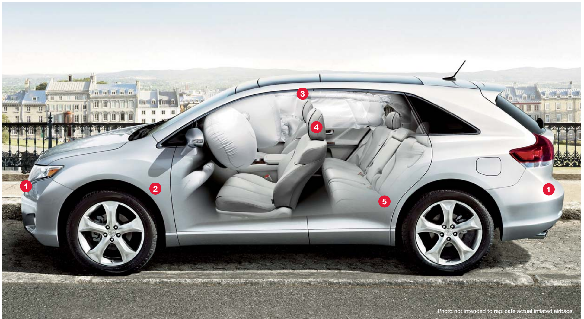
Photo not intended to replicate actual inflated airbags.

Helping to protect the smaller members of your family, LATCH (Lower Anchors and Tethers for CHildren) includes anchors and tethers on each outboard rear seat.