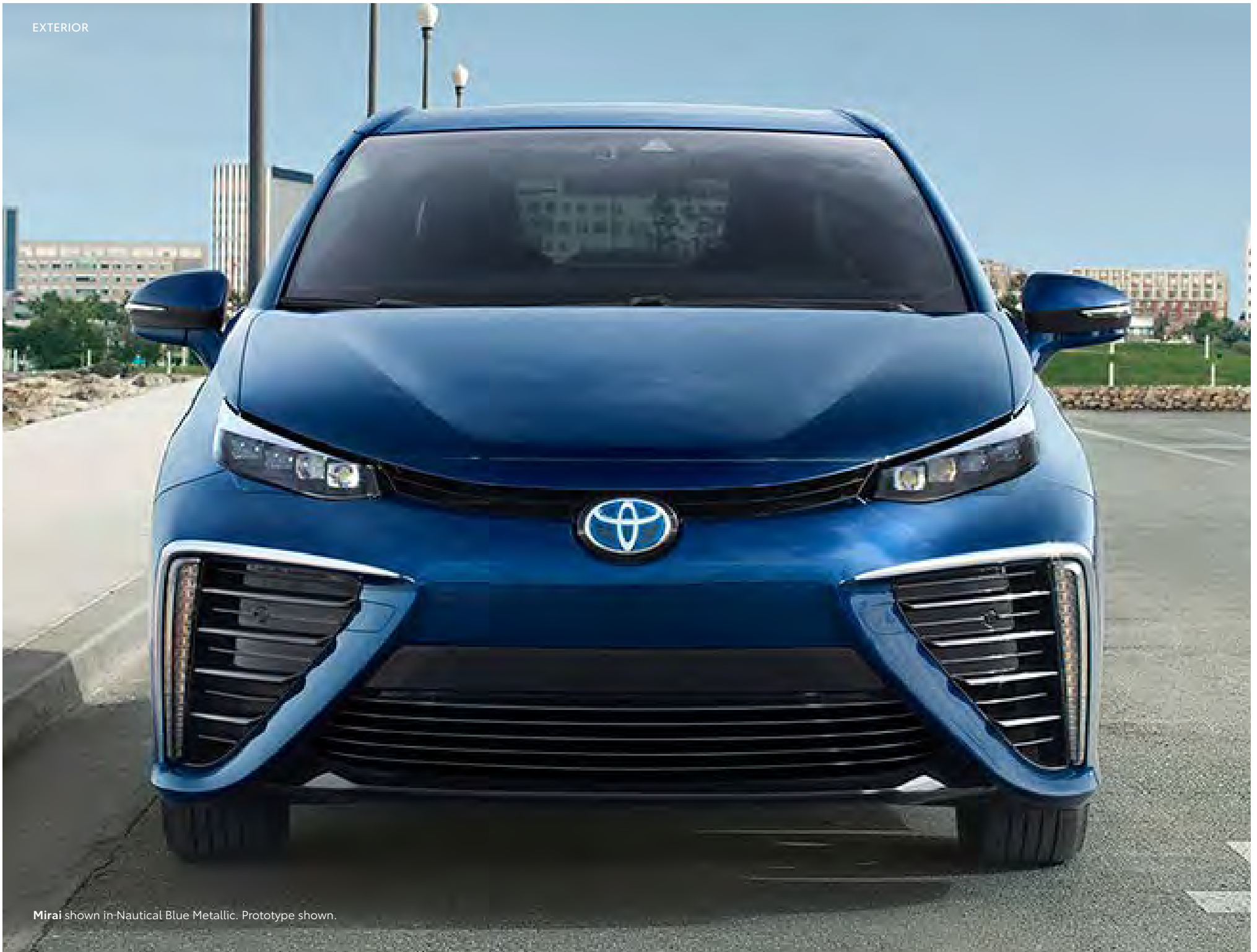
Mirai shown in Nautical Blue Metallic. Prototype shown.