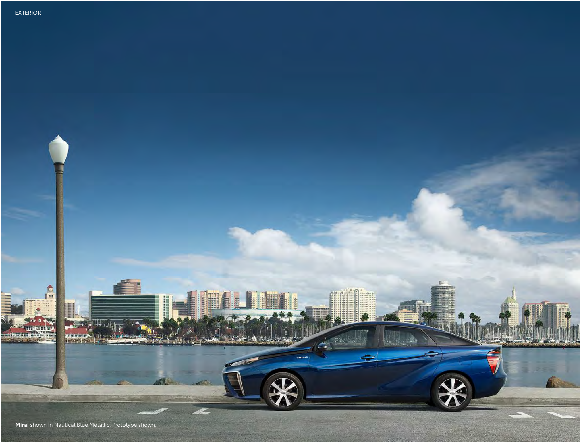
Mirai shown in Nautical Blue Metallic. Prototype shown.