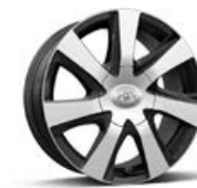
17-in. engraved alloy wheel