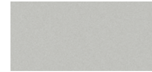
Elemental Silver 53