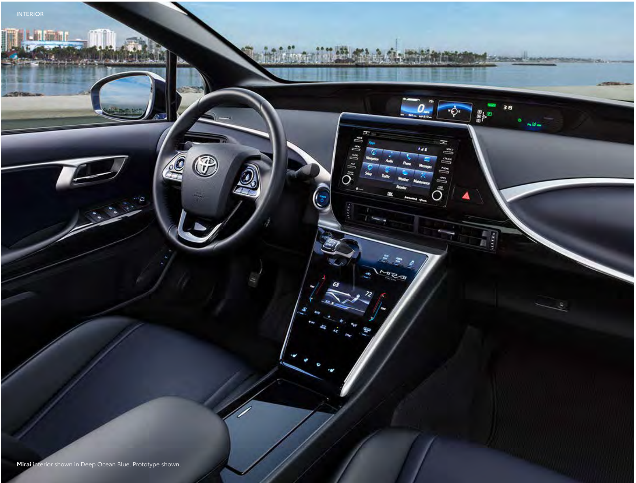
Mirai interior shown in Deep Ocean Blue. Prototype shown.