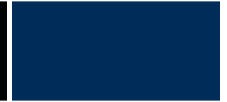
Nautical Blue Metallic