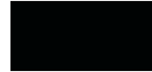
Celestial Black 53