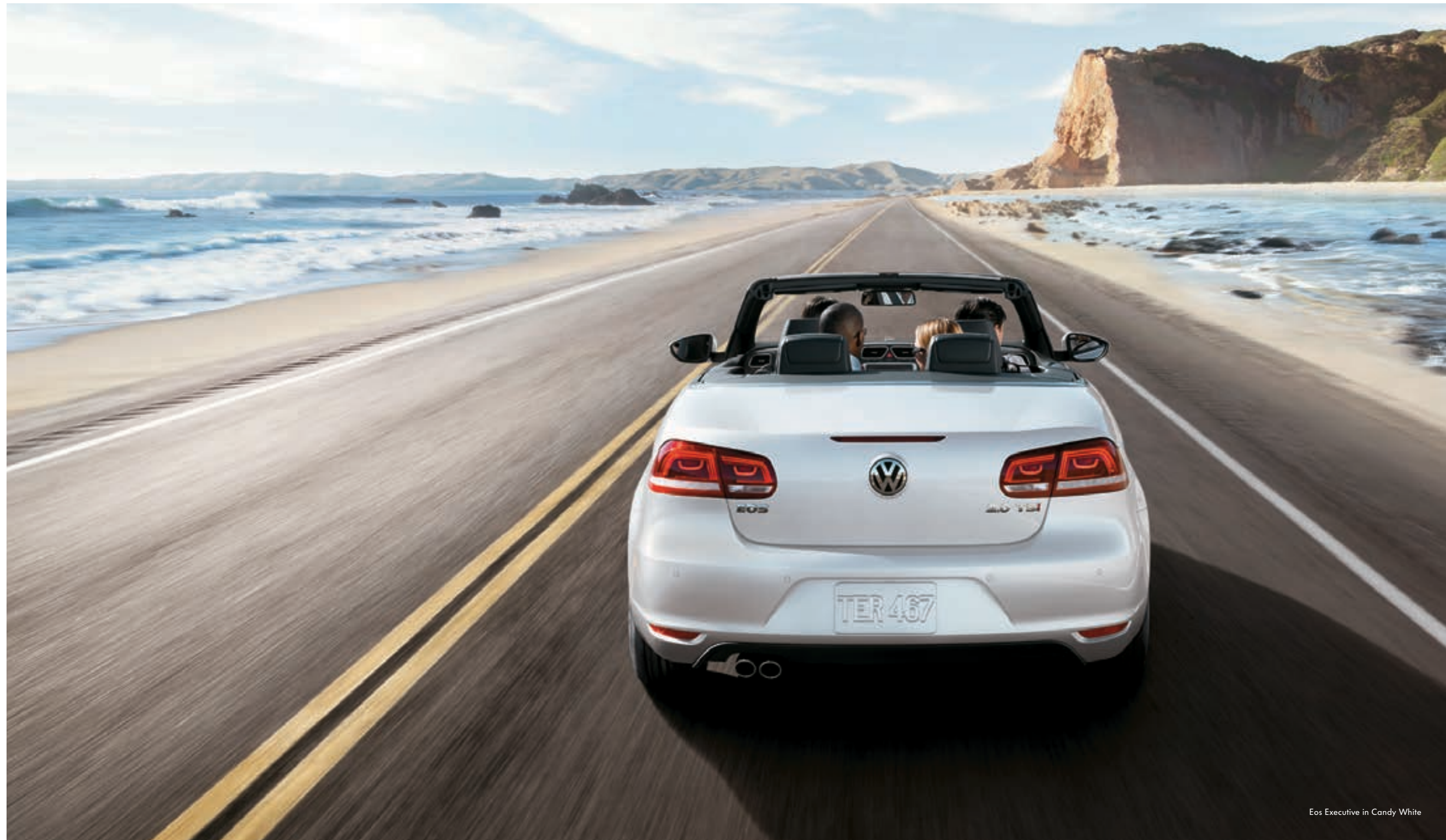
Eos Executive in Candy White

Wouldn't it be nice if you could get a convertible that you could enjoy all year round? Meet the new 2012 Eos. It has more than just an elegant new design; it's like having two cars in one. Not only is it the world's first automatic folding hardtop convertible with a power sunroof, but since it's a hardtop, it's also a coupe when the roof is up. Or should we say if the roof is up. Plus, it comes standard with a 2.0L turbocharged engine, a premium touchscreen sound system, Bluetooth® technology, and the option of heated leather seating surfaces. Did we mention it seats four? So if you've always wanted a coupe for your more practical side, and a convertible for your wild side, now you have both options. All in one gorgeous ride.