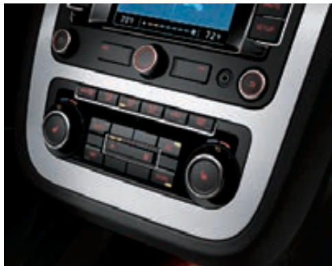
Dual climate control