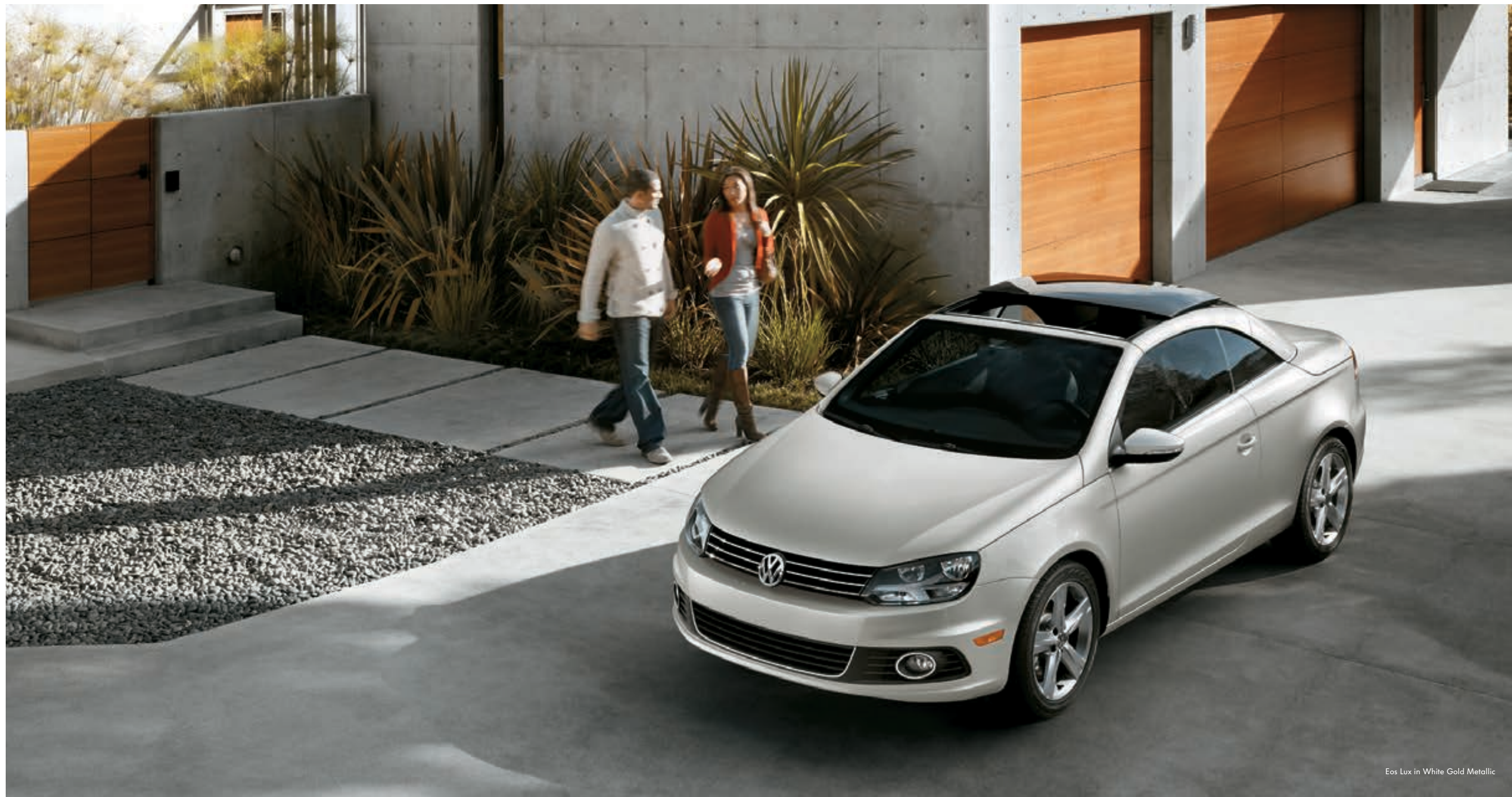
Eos Lux in White Gold Metallic

Now that you've experienced the new Eos from a full 360 degrees, you can see how we've made its gorgeous design even more beautiful. From its sleek, redesigned front lines to its sporty new back end, the new Eos is built to be fast and fun to drive. Plus, it has all kinds of little perks that make it feel oh so premium. Like heated washer nozzles to help prevent any kind of cold weather from clouding up your line of sight. And available Bi-Xenon™ headlights with an elegant set of LED daytime running lights that add a bold new detail to the completely redesigned front end. And rear lights that use fiber optic and LED technology to illuminate instantly, draw less energy, and last significantly longer than traditional bulbs. We even added brand-new foglights with a cornering feature to help illuminate your way when you put on your blinker or turn the wheel. We gave the new Eos all that because we know you'd like to be out on the open road enjoying the scenery for as long as you possibly can. And if you encounter any weather along the way, you'll want all these features to help guide you through.