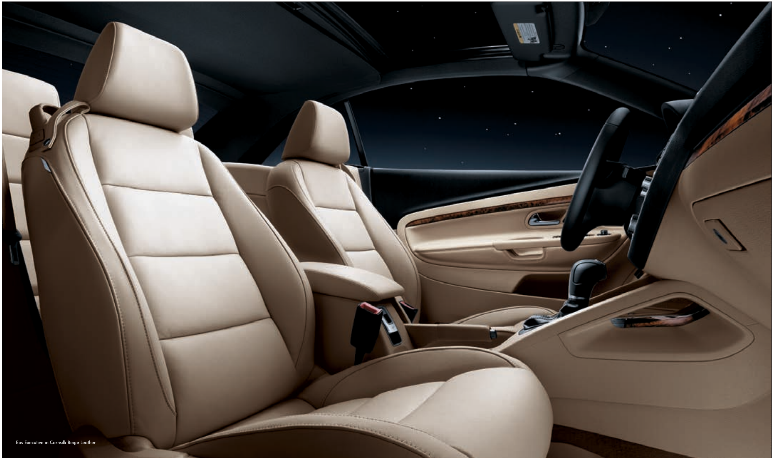
Eos Executive in Cornsilk Beige Leather