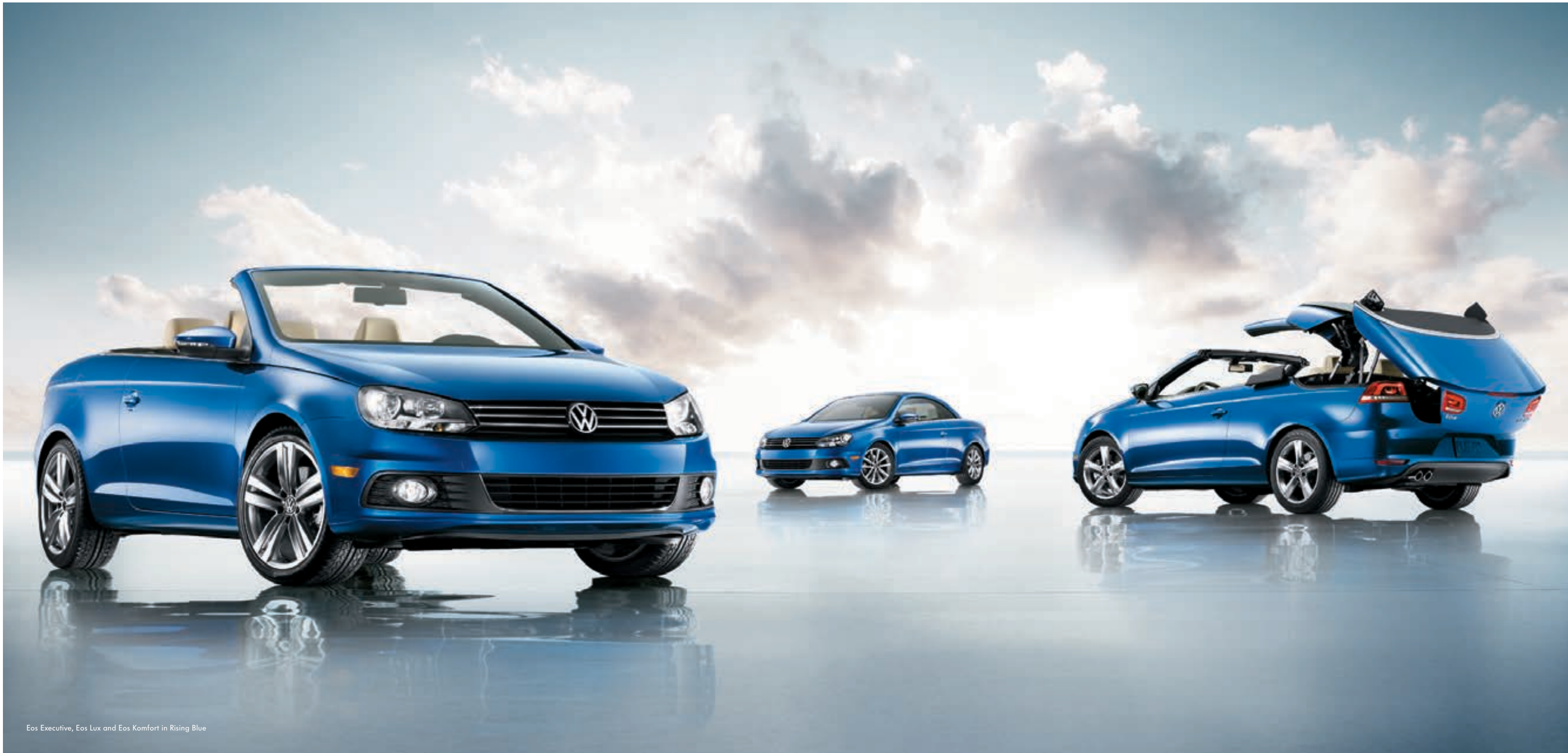
Eos Executive, Eos Lux and Eos Komfort in Rising Blue