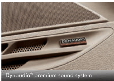
Dynaudio® premium sound system