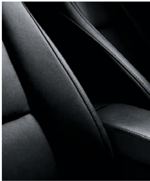
Heated front seats