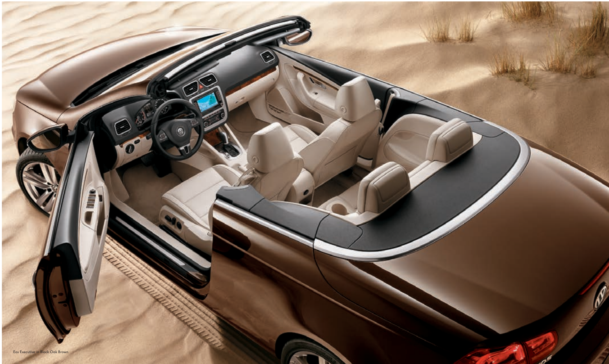
Eos Executive in Black Oak Brown