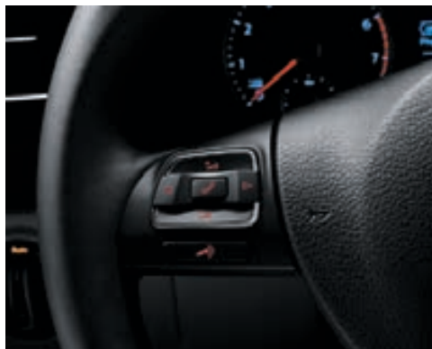
Bluetooth with voice command