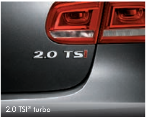
2.0 TSI® turbo