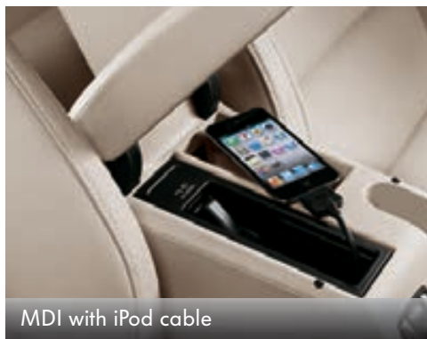
MDI with iPod cable