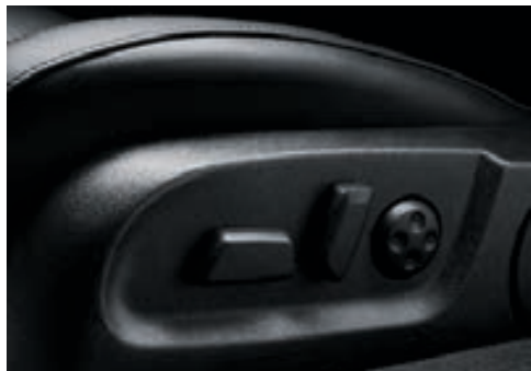
12-way dual-power seats