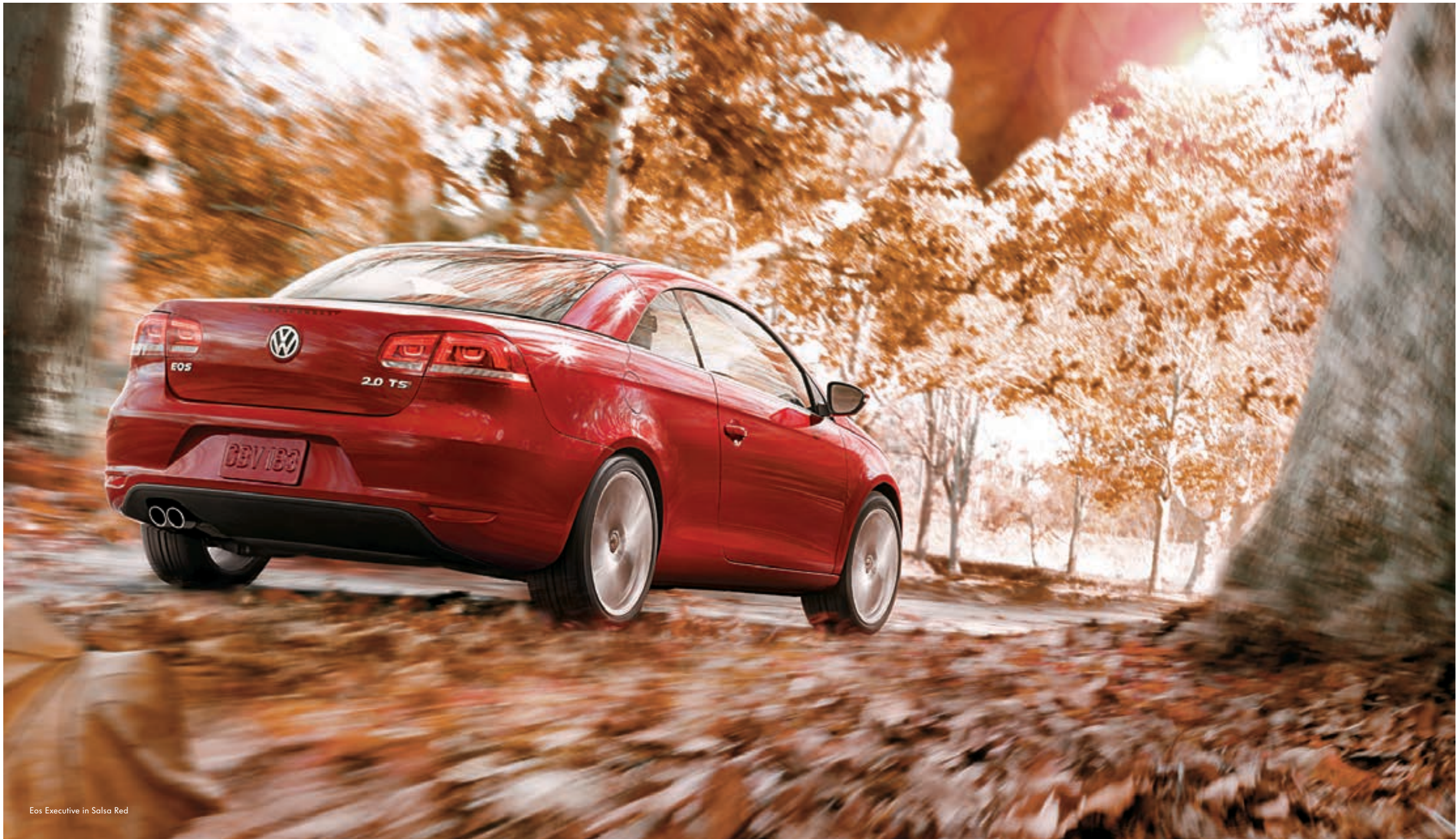
Eos Executive in Salsa Red