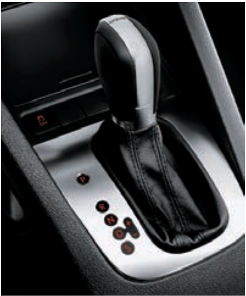
6-speed DSG automatic transmission

Performance. Wondering what a sport-tuned suspension means? Well, it sits lower and corners tighter. And that makes every turn, every open freeway, and every winding road just a little bit sweeter. For you and three other lucky friends you take along for the ride.