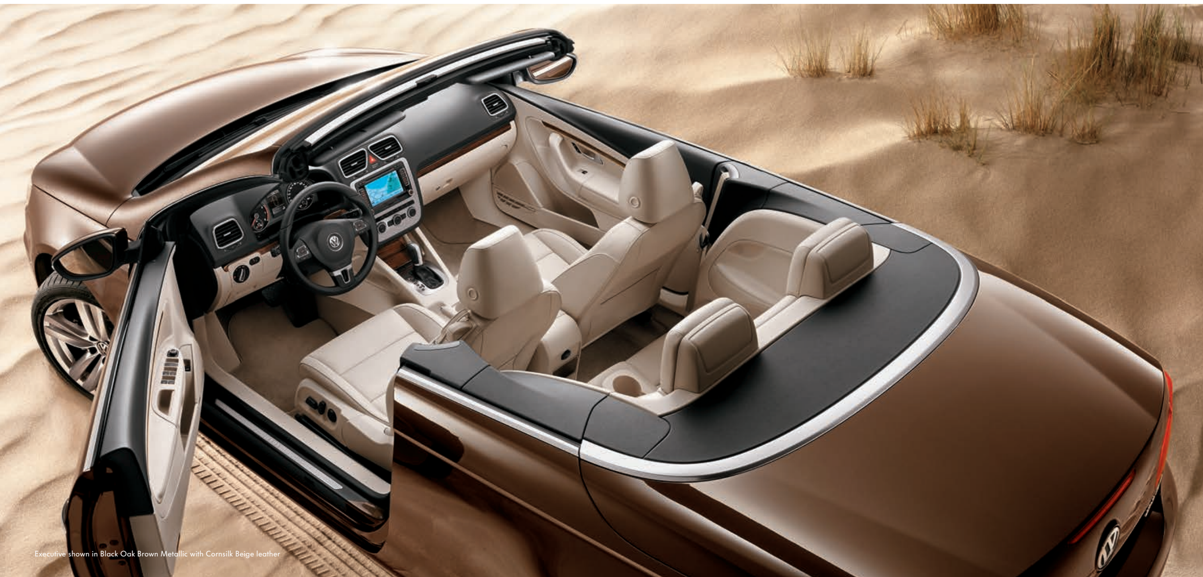
Executive shown in Black Oak Brown Metallic with Cornsilk Beige leather