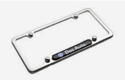
License Plate Frame