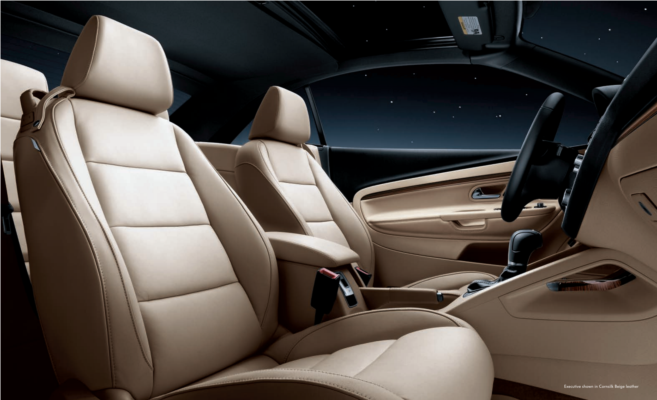
Executive shown in Cornsilk Beige leather