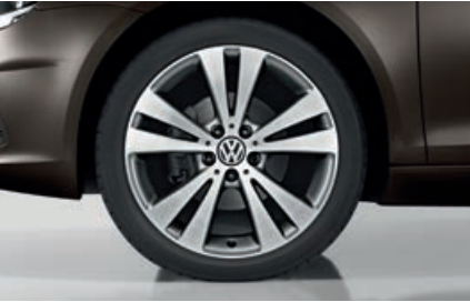
Lux 18" Chicago