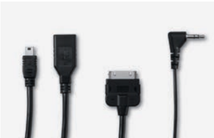
Variety of MDI Cables for Digital Playback Devices