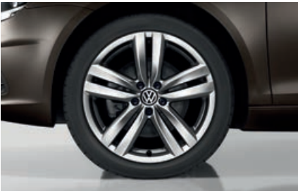
Executive 18" Kansas