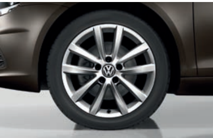
Komfort 17" Michigan