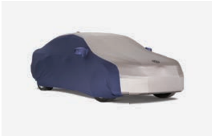
Custom Car Cover