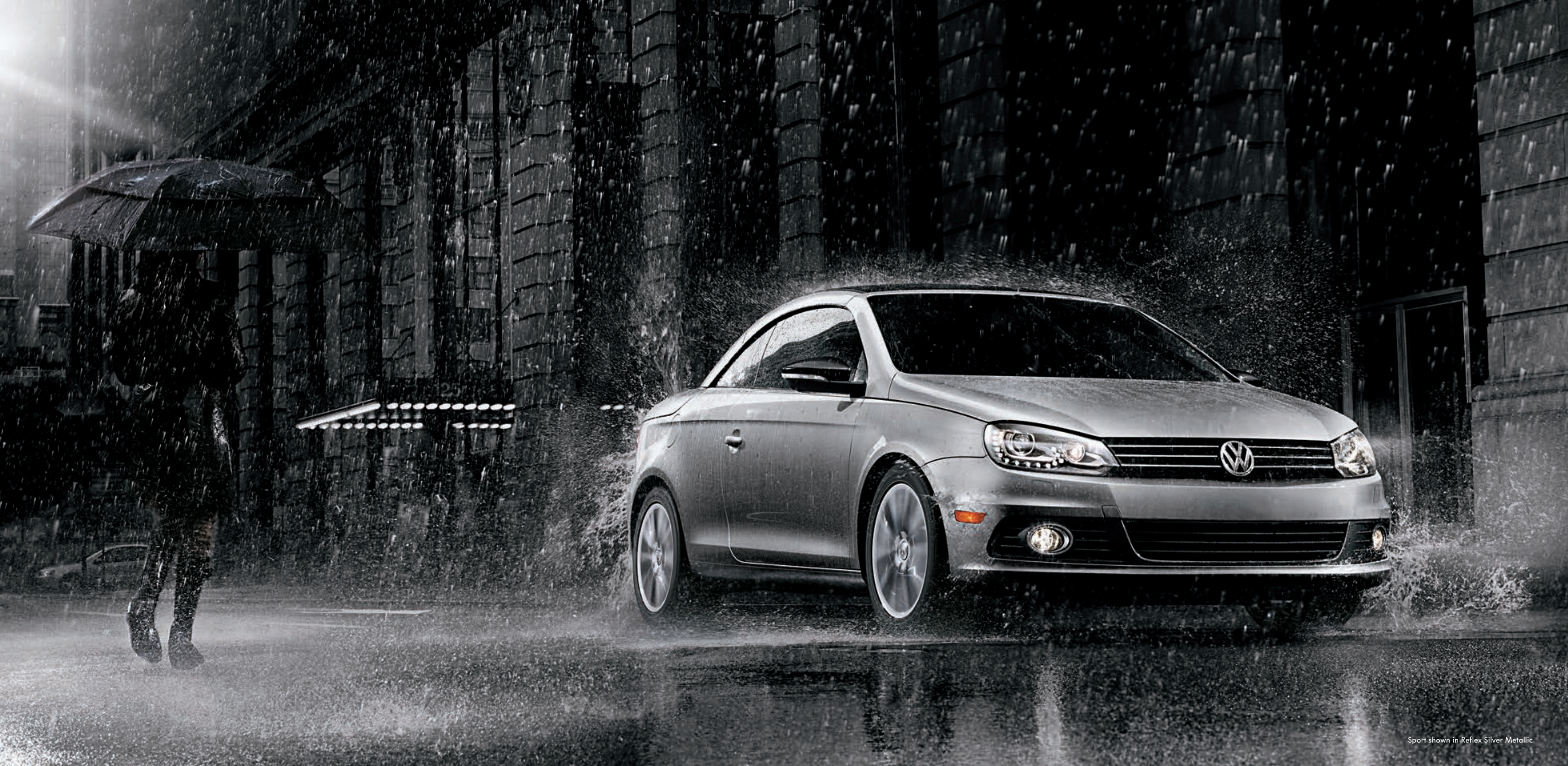
Sport shown in Reflex Silver Metallic

3 Years or 36,000 Miles of No-Charge Scheduled Maintenance. Whichever occurs first. Some restrictions. See dealer or program for details.