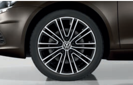
Sport 18" Vicenza