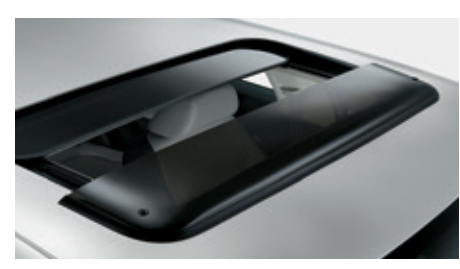
Sunroof Wind Deflector