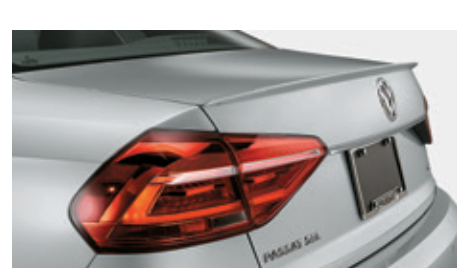
Rear Lip Spoiler