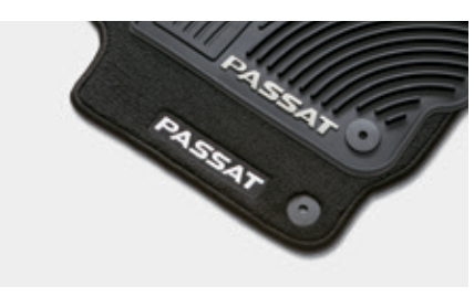
MojoMats® and Monster Mats®