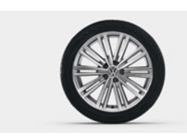
19" Luxor Wheel