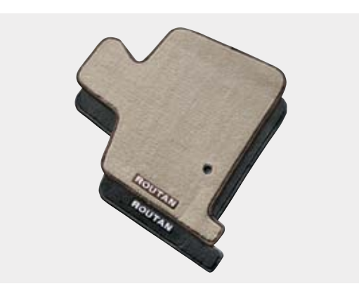
MojoMats® available in dark gray and tan Third-row mats also available