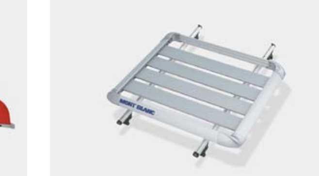
Base Carrier Bars with Luggage Platform