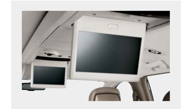
Rear Seat Entertainment available with two monitors