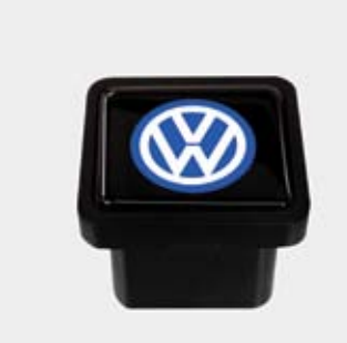
Trailer Hitch Cover