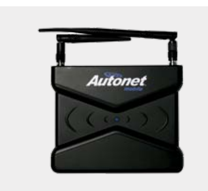
AutoNet Mobile™ Wi-Fi Router