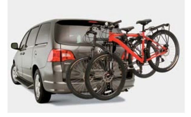
Hitch Mount Rack Attachment for 2 or 4 Bikes‡