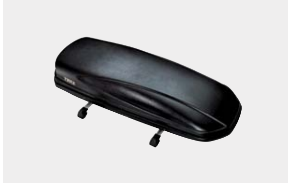
Base Carrier Bars with Roof Box Carrier Attachment