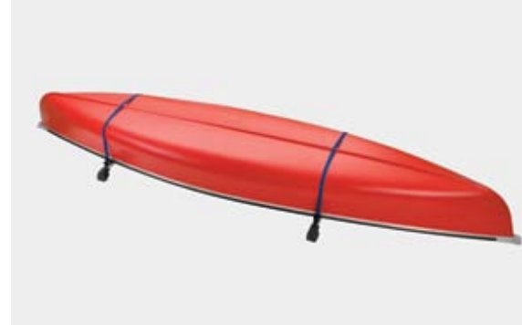
Base Carrier Bars with Canoe Carrier Attachment