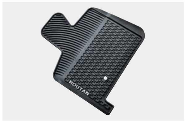
Monster Mats® Third-row mats also available