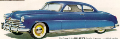
The Super Series CLUB COUPE . Room for six passengers . . . 123-inch wheelbase . . . your choice of the high-torque premium Super-Six engine, America's most powerful Six, or the even more powerful high-compression Super-Eight. 8 standard body colors, 2 special body colors and 4 two-tone combinations. front outer bumper guard, Super-Drive and white sidewall tires optional at extra cost.

Hudson Weather-Control does far more than an ordinary heater. It brings in fresh outside air through the cowl ventilator, filters out dirt or insects . . . warms it in winter to the temperature you desire, then circulates it gently and evenly through the interior.