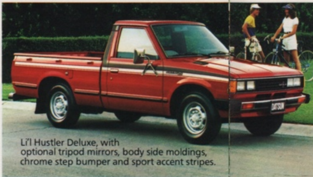
Li'l Hustler Deluxe, with optional tripod mirrors, body side moldings, chrome step bumper and sport accent stripes.