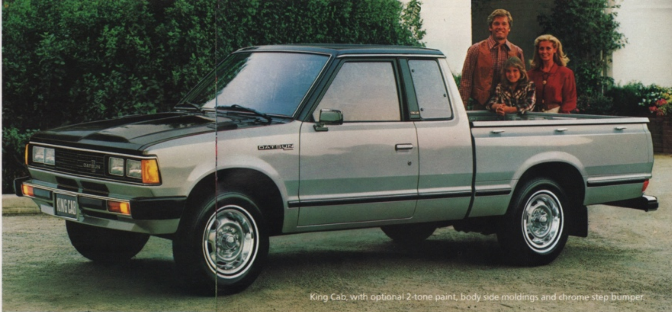
King Cab, with optional 2-tone paint, body side moldings and chrome step bumper.