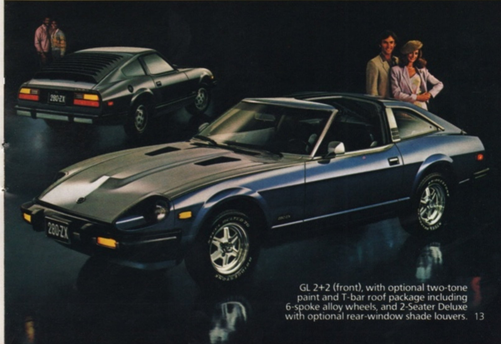
GL 2+2 (front), with optional two-tone paint and T-bar roof package including 6-spoke alloy wheels, and 2-Seater Deluxe with optional rear-window shade louvers.

*Vehicles with optional equipment or California emissions equipment will be slightly heavier.