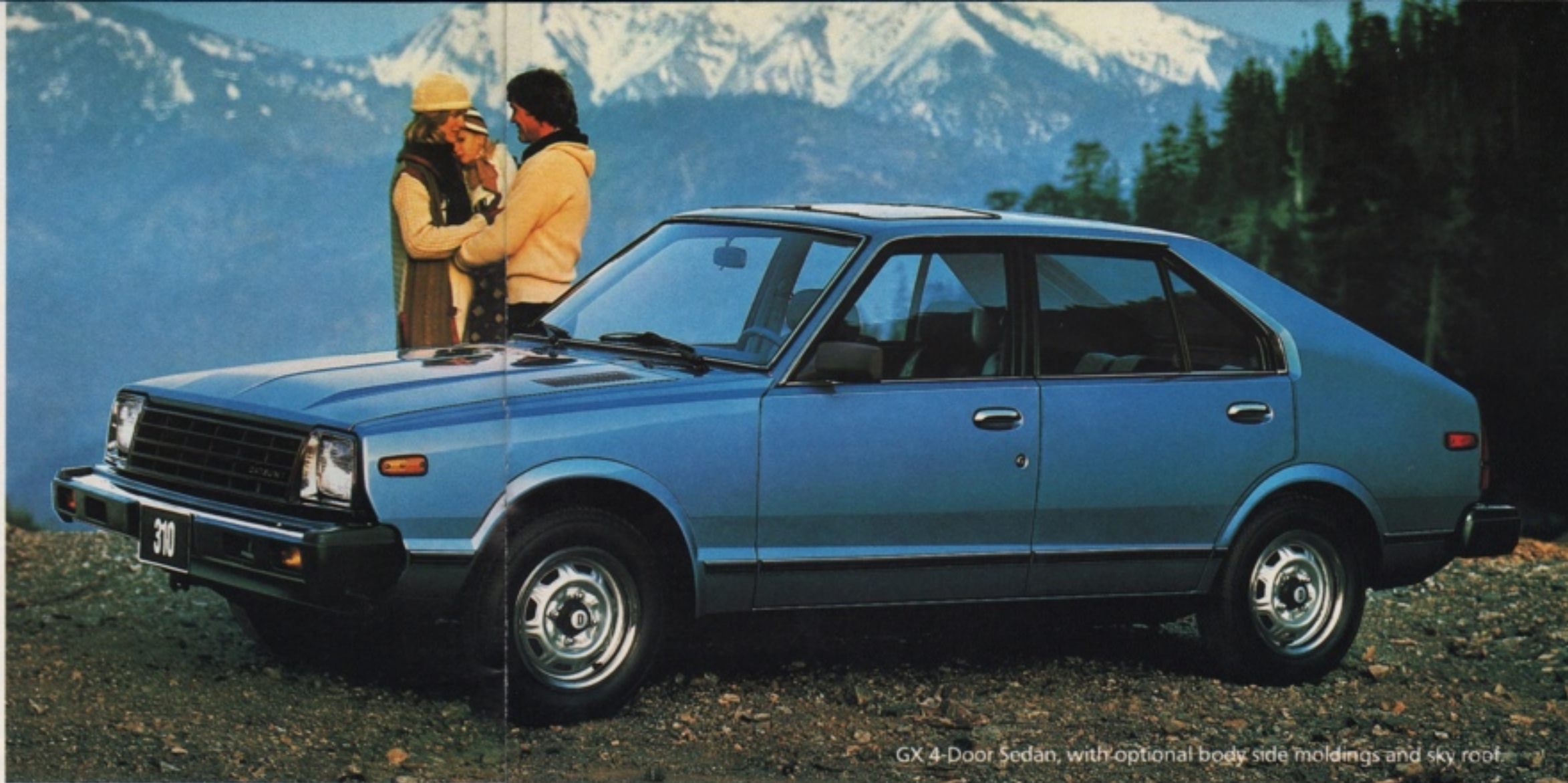
GX 4-Door Sedan, with optional body side moldings and sky roof.