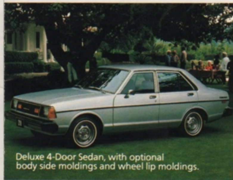
Deluxe 4-Door Sedan, with optional body side moldings and wheel lip moldings.

†Vehicles with optional equipment or California emissions equipment will be slightly heavier. ††Standard model: 1905.