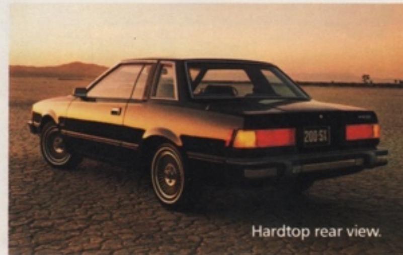
Hardtop rear view.

**Vehicles with optional equipment or California emissions equipment will be slightly heavier.