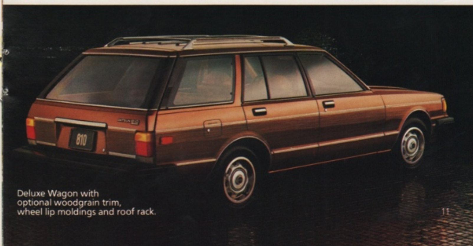
Deluxe Wagon with optional woodgrain trim, wheel lip moldings and roof rack.