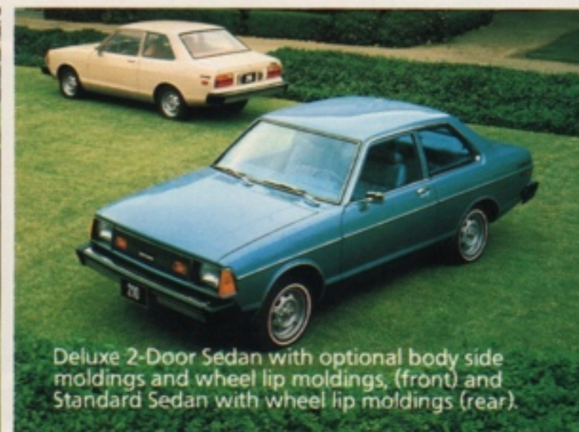
Deluxe 2-Door Sedan with optional body side moldings and wheel lip moldings, (front) and Standard Sedan with wheel lip moldings (rear).