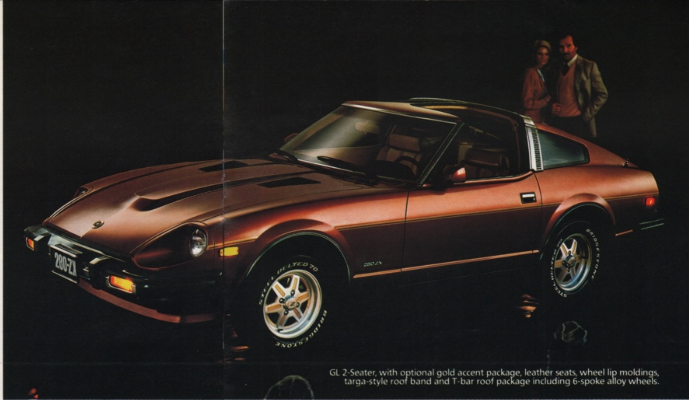
GL 2-Seater, with optional gold accent package, leather seats, wheel lip moldings, targa-style roof band and T-bar roof package including 6-spoke alloy wheels.