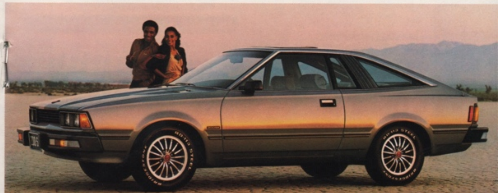
Sport Luxury Hatchback, with optional mag-style alloy wheels, sky roof and body side moldings.