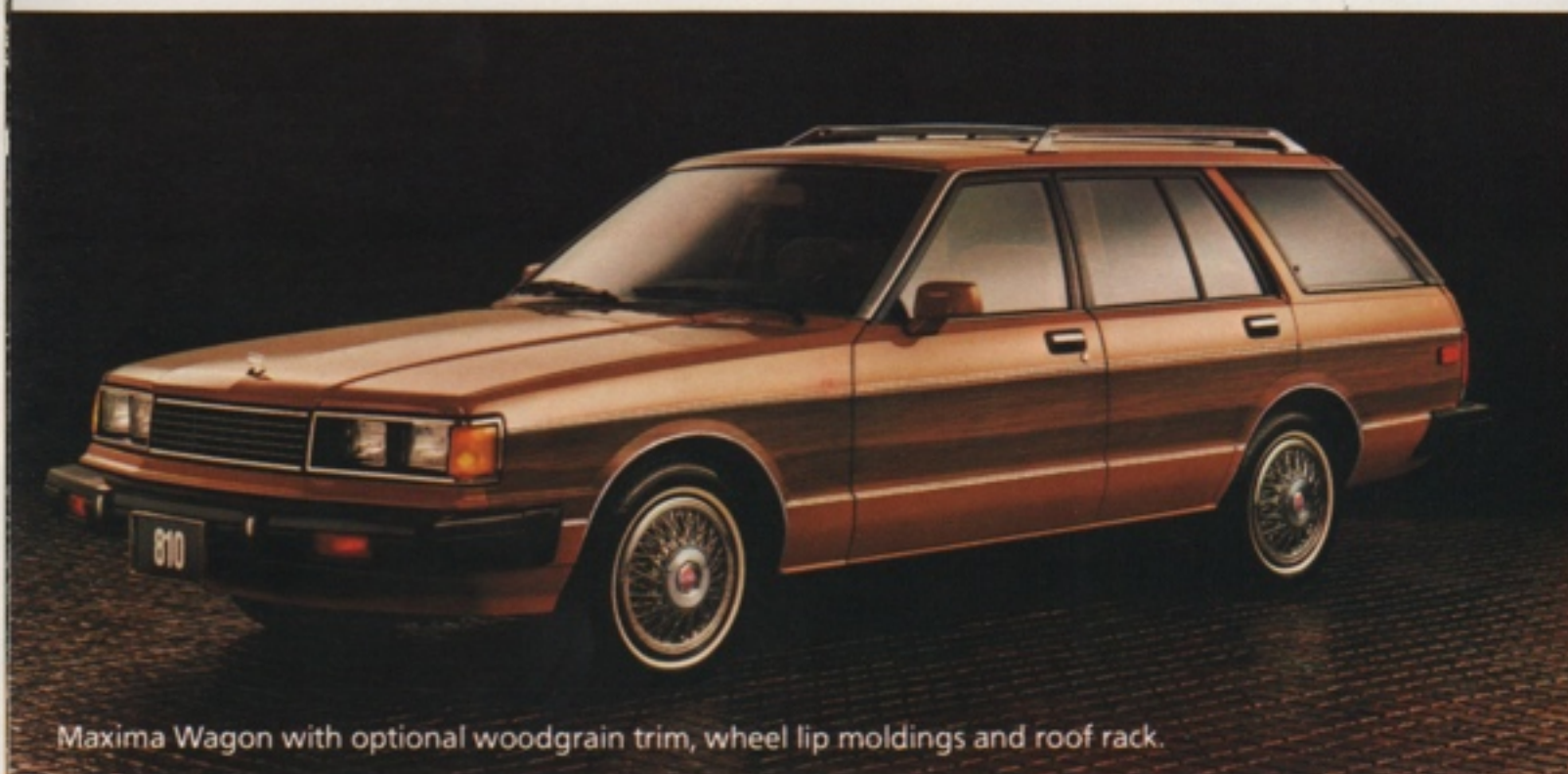
Maxima Wagon with optional woodgrain trim, wheel lip moldings and roof rack.

*Vehicles with optional equipment or California emissions equipment will be slightly heavier.