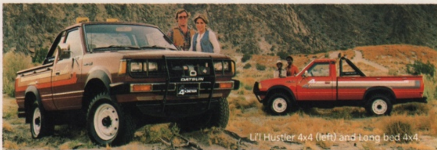
Li'l Hustler 4x4 (left) and Long bed 4x4.

Above trucks shown with optional grille and brush guards, winch, tripod mirrors, light bar, halogen off-road lights, graphic stripes, tubular rear bumper, fender flares and body side moldings.