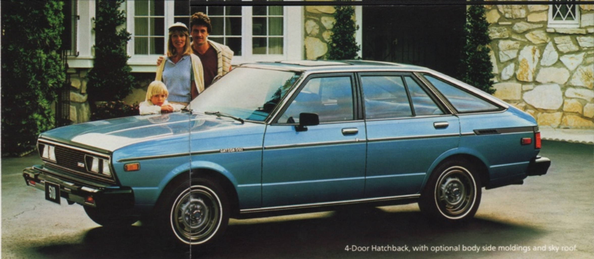
4-Door Hatchback, with optional body side moldings and sky roof.