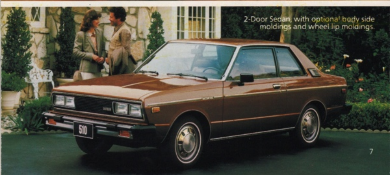
2-Door Sedan, with optional body side moldings and wheel lip moldings.