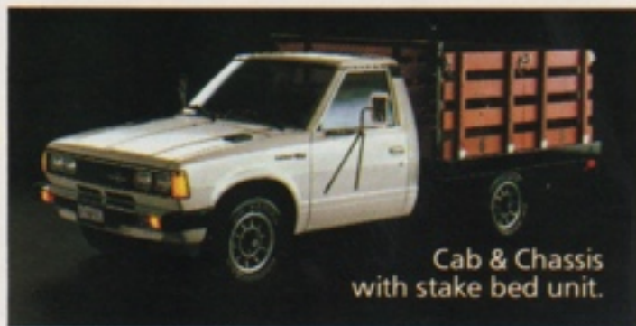
Cab & Chassis with stake bed unit.

Cab & Chassis offers many applications available from your Datsun Dealer. The completed vehicle shown is an example of one of the applications which may be made of the Datsun Cab & Chassis. Nissan Motor Co., Ltd., and Nissan Motor Corporation in U.S.A. make no representations, nor do they authorize others to make any representations on their behalf, as to the suitability of a particular application, conversion or completion of the Cab & Chassis.