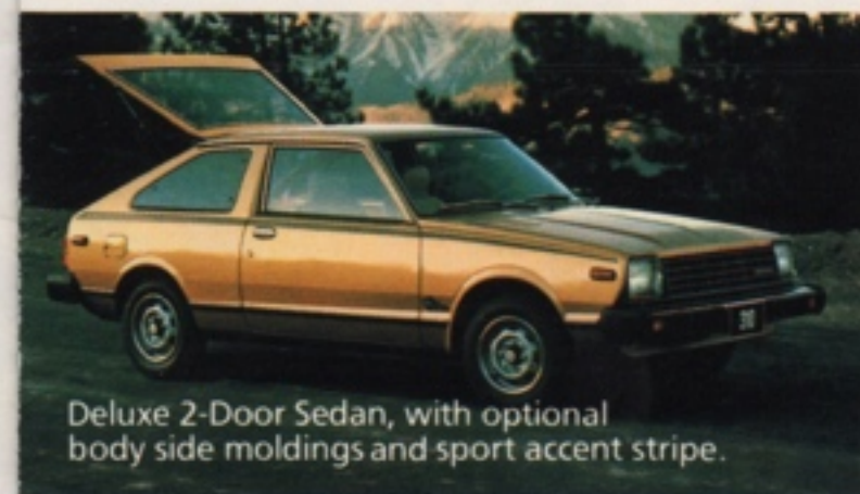
Deluxe 2-Door Sedan, with optional body side moldings and sport accent stripe.

**Vehicles with optional equipment or California emissions equipment will be slightly heavier.