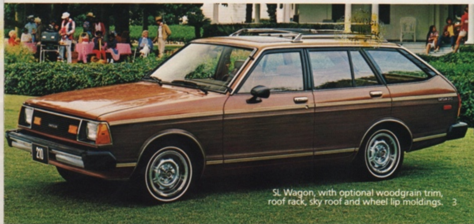
SL Wagon, with optional woodgrain trim, roof rack, sky roof and wheel lip moldings.