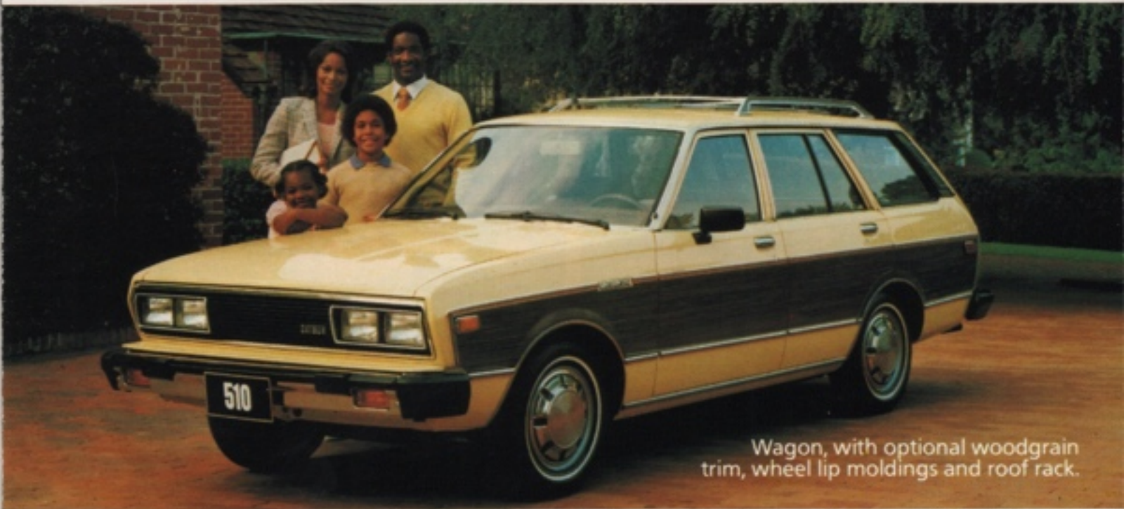
Wagon, with optional woodgrain trim, wheel lip moldings and roof rack.

**Vehicles with optional equipment or California emissions equipment will be slightly heavier.