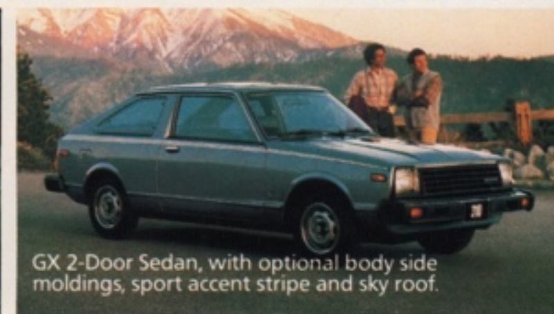
GX 2-Door Sedan, with optional body side moldings, sport accent stripe and sky roof.