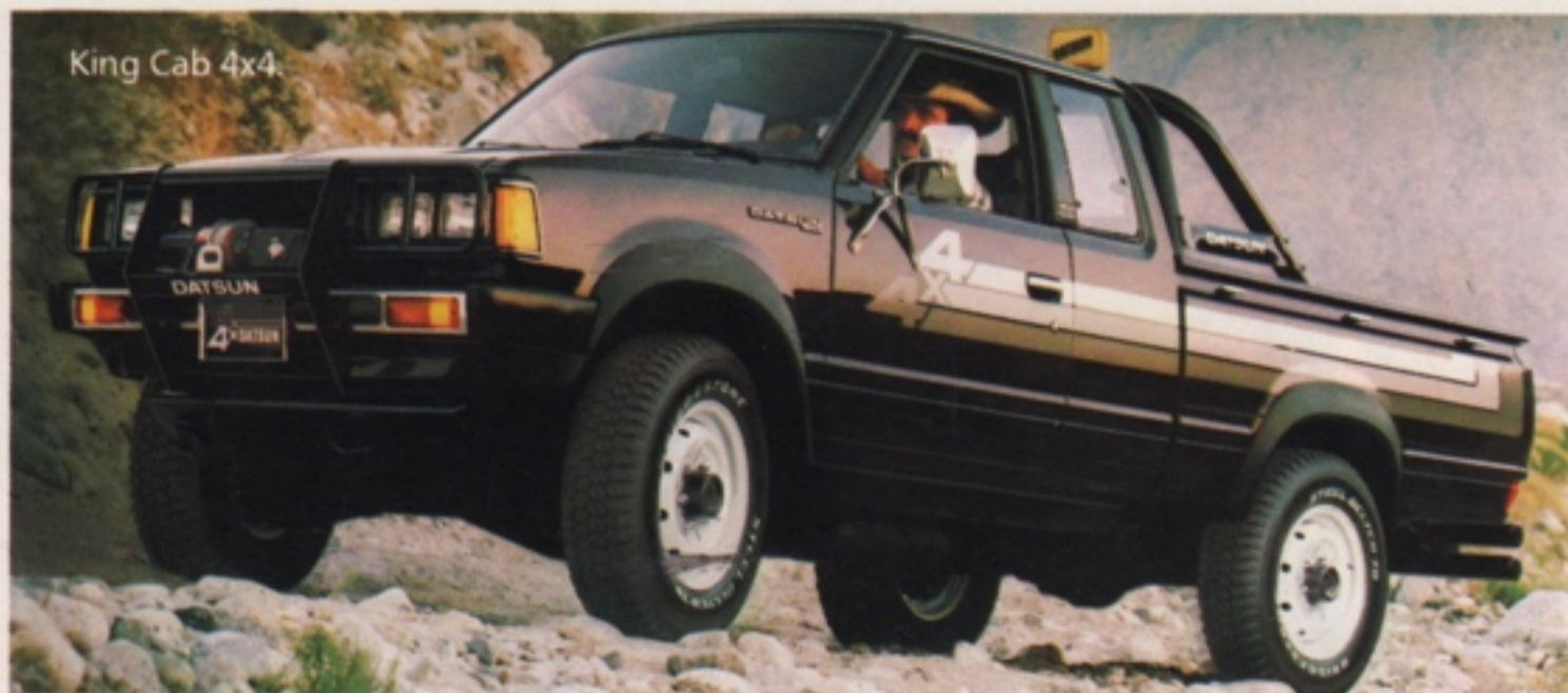
King Cab 4x4.