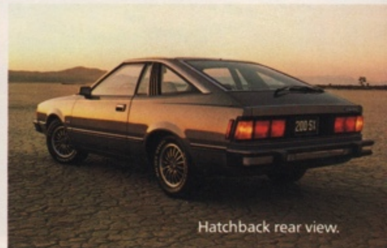
Hatchback rear view.