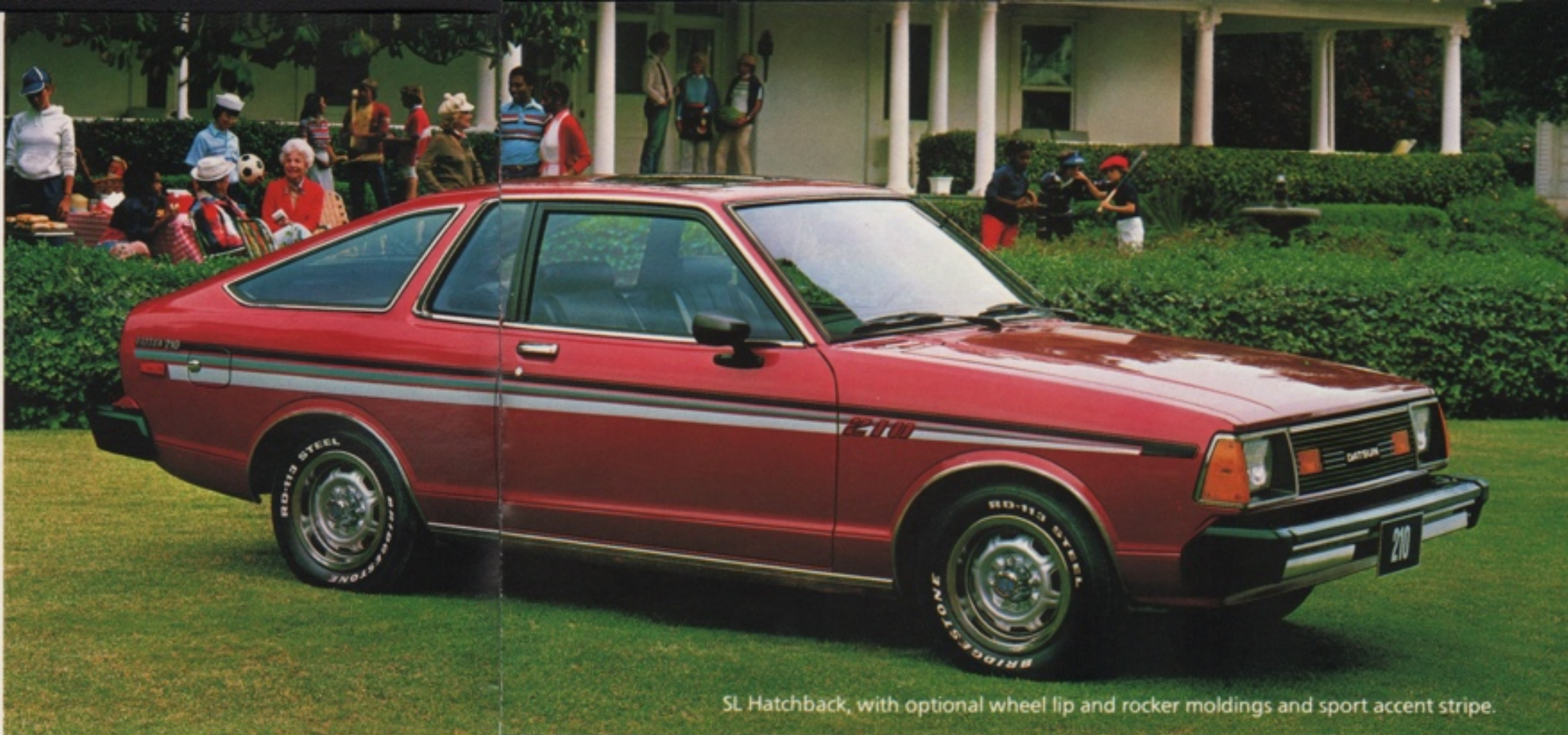
SL Hatchback, with optional wheel lip and rocker moldings and sport accent stripe.