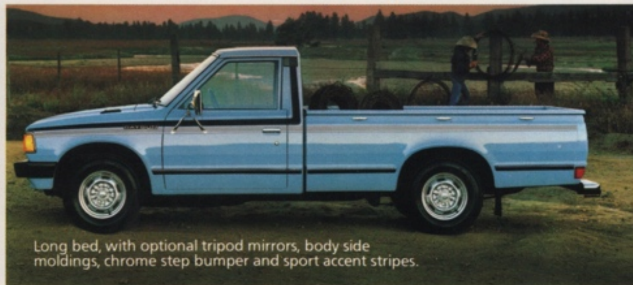
Long bed, with optional tripod mirrors, body side moldings, chrome step bumper and sport accent stripes.