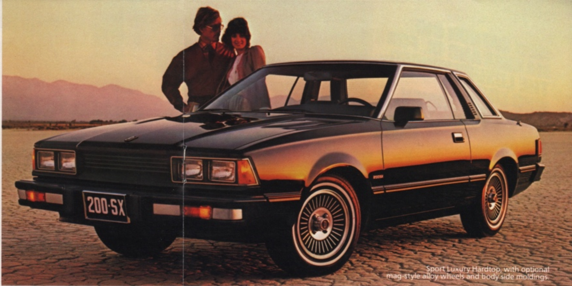
Sport Luxury Hardtop, with optional mag-style alloy wheels and body side moldings.