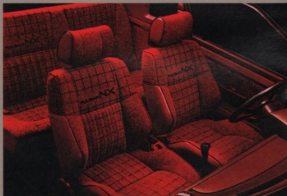
COMFORTABLE INTERIOR OF PULSAR NX

* Nissan Pulsar NX with 5-Speed: 38 EST HWY/31 EST CITY Nissan Pulsar NX with Automatic: 30 EST HWY/27 EST CITY 1986 E.P.A. estimates. Remember use these E.P.A. estimates for comparison. Actual mileage may vary depending upon driving conditions. Some items shown are optional. See the 1986 Nissan Pulsar NX brochure for more complete information.