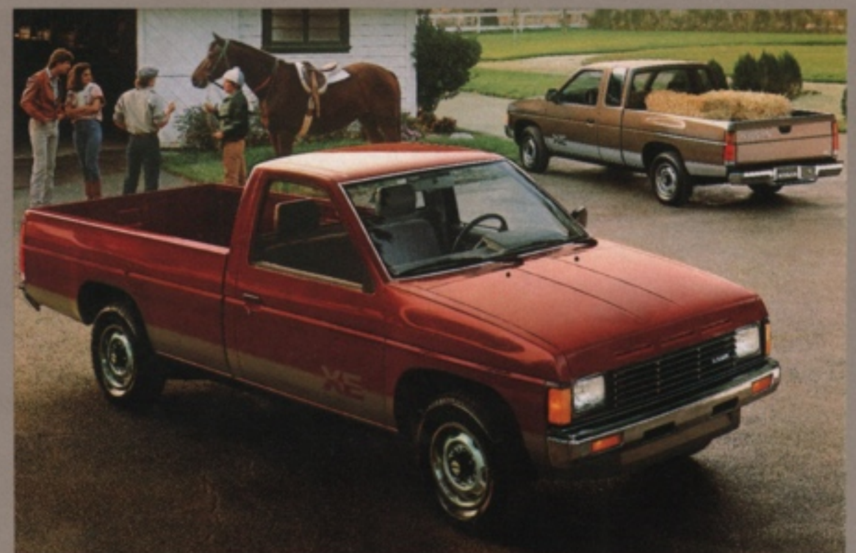
(TOP) NISSAN XE KING CAB, (BOTTOM) NISSAN XE LONG BED