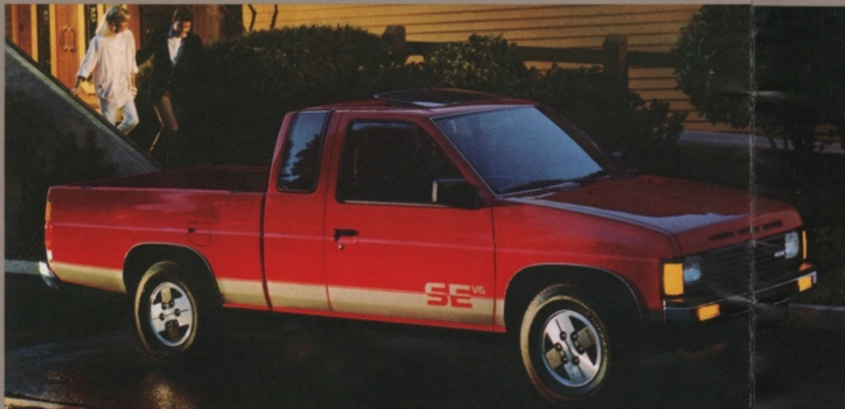
NISSAN SE KING CAB

engine • 4-passenger seating in King Cab® with hideaway jump seats (SE and XE) • New wrapover quarter windows • Sliding rear window (SE) • Pop-up tie-down hooks (SE) • Removable tailgate with quick release • Optional pop-up sunroof (SE with Sport Package and Power Package)