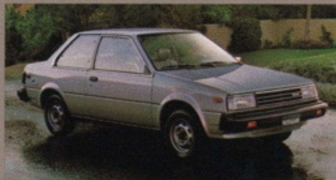
NISSAN SENTRA STANDARD 2-DOOR SEDAN