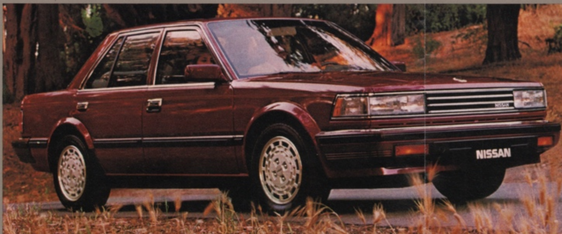
NISSAN MAXIMA GL SEDAN