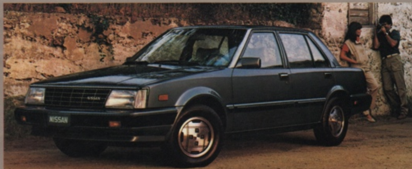
NISSAN STANZA GL SEDAN

So stretch out in style with Stanza. It won't stretch your budget.