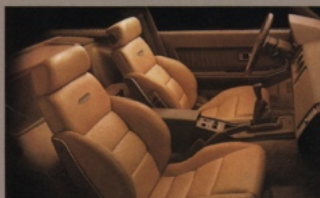
NISSAN 300 ZX OPTIONAL LEATHER INTERIOR