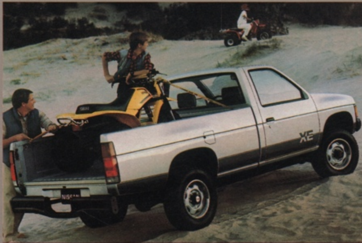
NISSAN XE LONG BED 4x4

Sport Package on SE) with power windows, power door locks, cruise control, variable intermittent wipers, dual power side mirrors and 4-speaker stereo radio with cassette deck • Optional Sport Package (available with Power Package on SE) with alloy wheels, pop-up sunroof, 31x10.50R15 tires and fender flares.