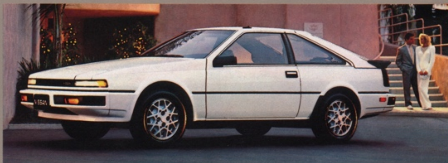
NISSAN 200 SX XE HATCHBACK