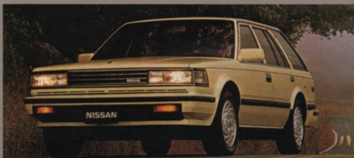
NISSAN MAXIMA GL WAGON

Nissan Maxima combines a fuel-injected, 3.0-liter V6 engine with features like front-wheel drive and power rack-and-pinion steering to give you a smooth ride and better handling.