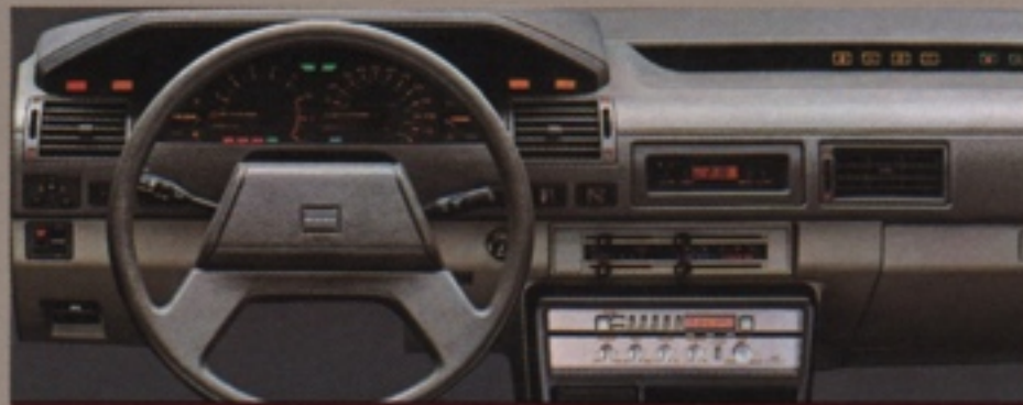
NISSAN 200 SX TURBO INSTRUMENT PANEL

rack-and-pinion steering • Cruise control (XE and Turbo models) • Tilt steering column • AM/FM electronically tuned stereo with digital readout • Pop-up halogen headlights... and much, much more.