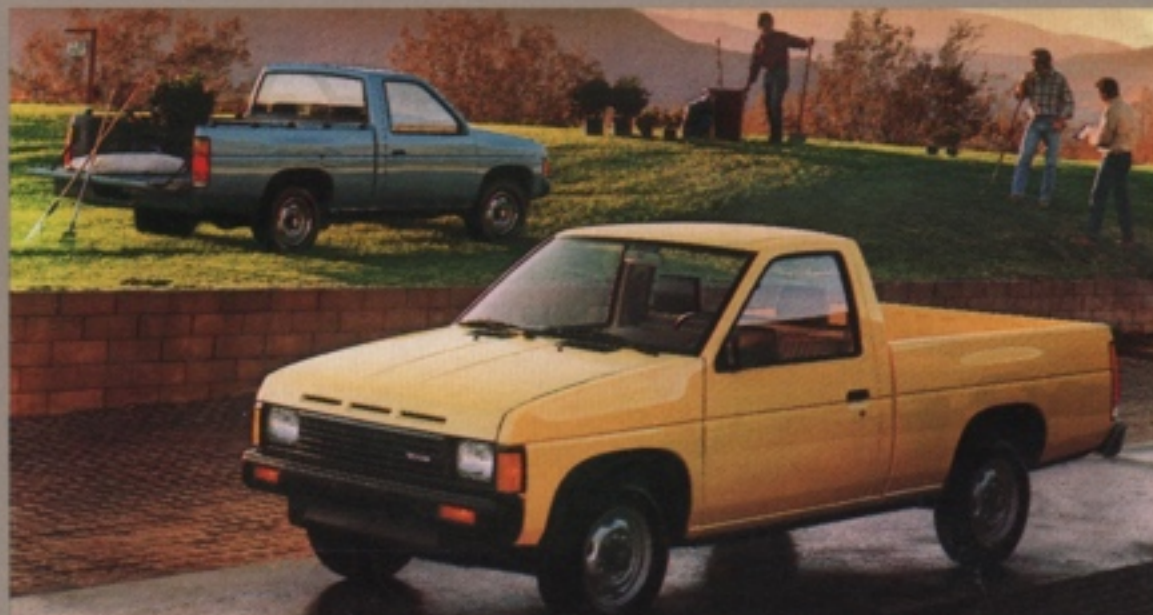
(TOP) NISSAN E REGULAR BED, (BOTTOM) NISSAN STANDARD REGULAR BED