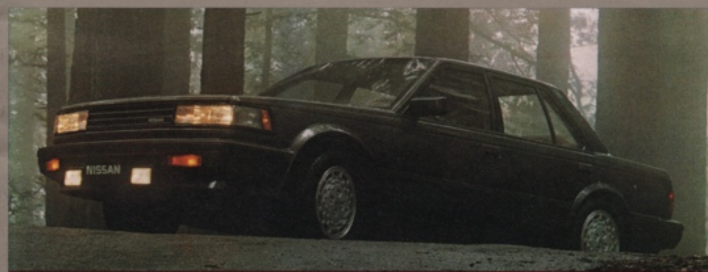
NISSAN MAXIMA SE SEDAN

Some items shown are optional. See the 1986 Nissan Maxima brochure for more complete information.