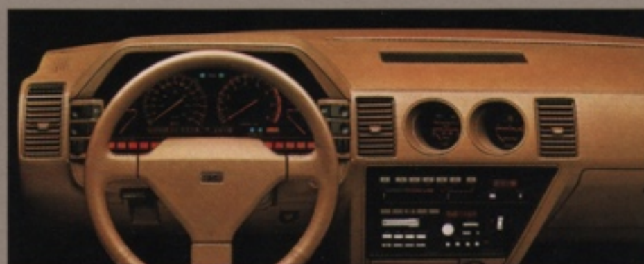
NISSAN 300 ZX ANALOG INSTRUMENT PANEL

• 4-wheel independent suspension • Optional Leather Package • Optional Electronic Equipment Package with 80-watt AM/FM stereo, graphic equalizer and microprocessor-controlled automatic air conditioning • 3-way driver-adjustable shock absorbers (Turbo) ... and much, much more.