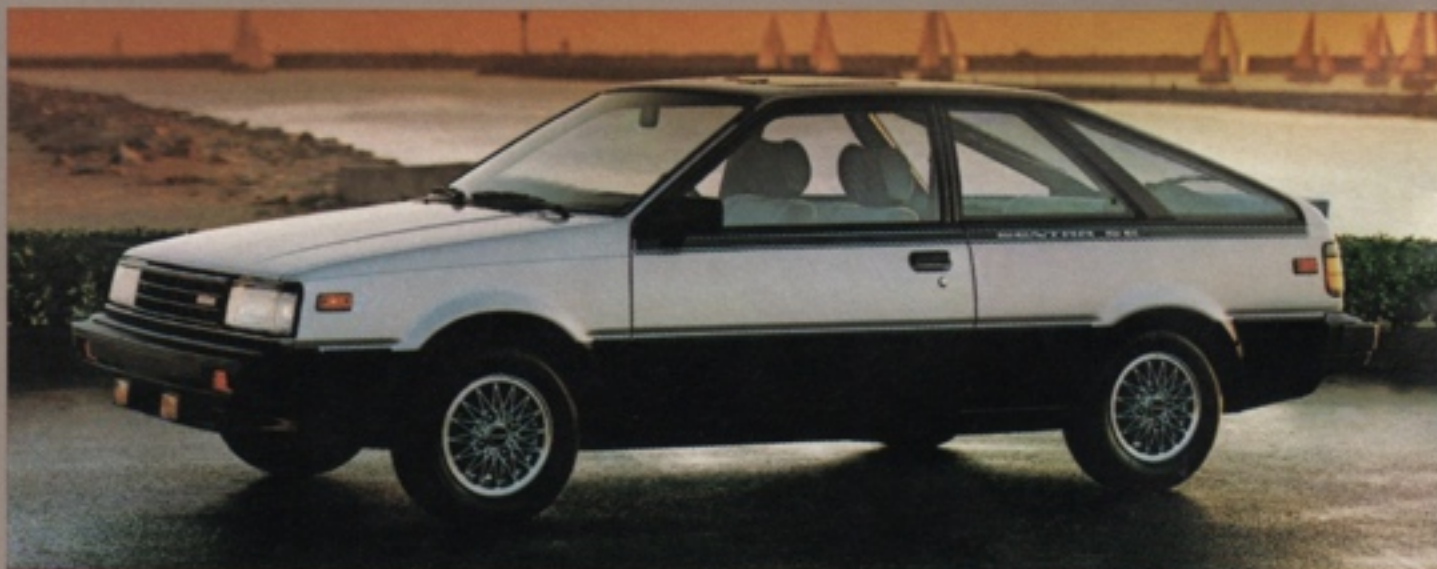
NISSAN SENTRA SE HATCHBACK COUPE