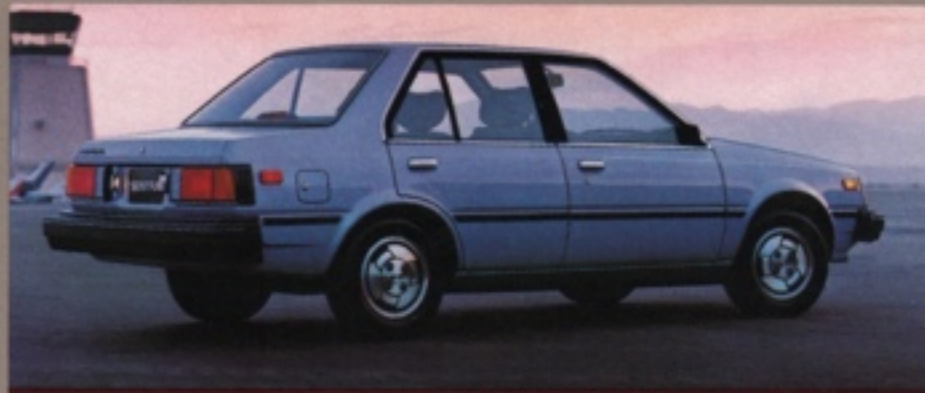
NISSAN SENTRA XE 4-DOOR SEDAN

*Nissan Sentra with 5-Speed: 38 EST HWY/31 EST CITY Nissan Sentra with Automatic: 30 EST HWY/27 EST CITY 1986 E.P.A. estimates. Remember, use these E.P.A. estimates for comparison. Actual mileage may vary depending upon driving conditions.