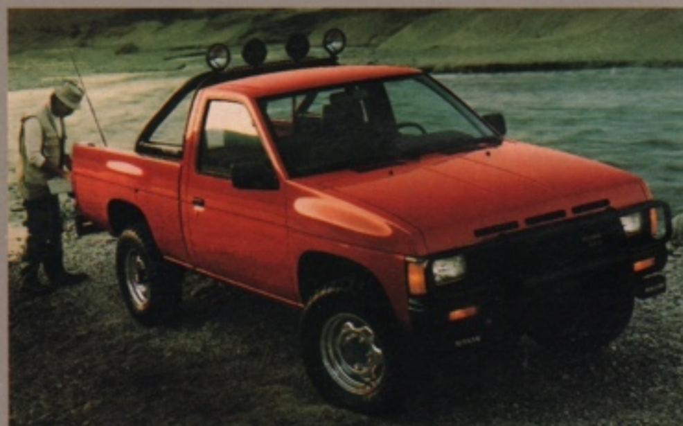
NISSAN SE REGULAR BED 4x4