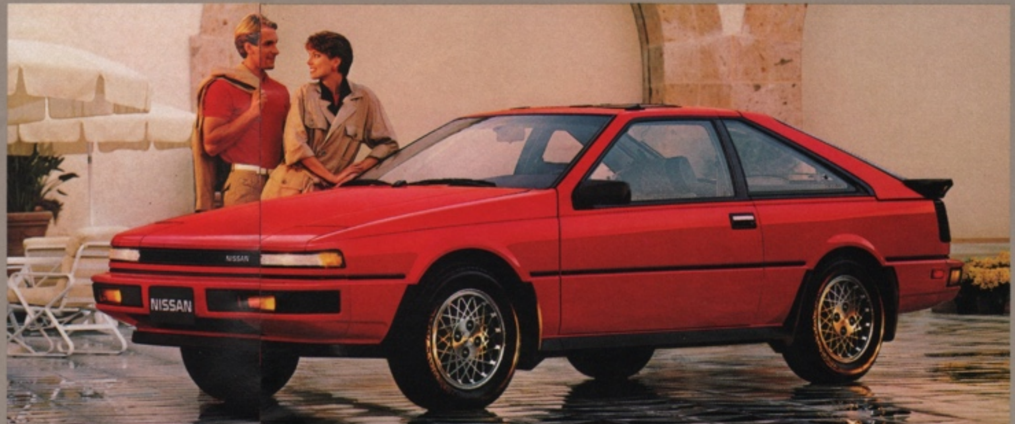
NISSAN 200 SX TURBO