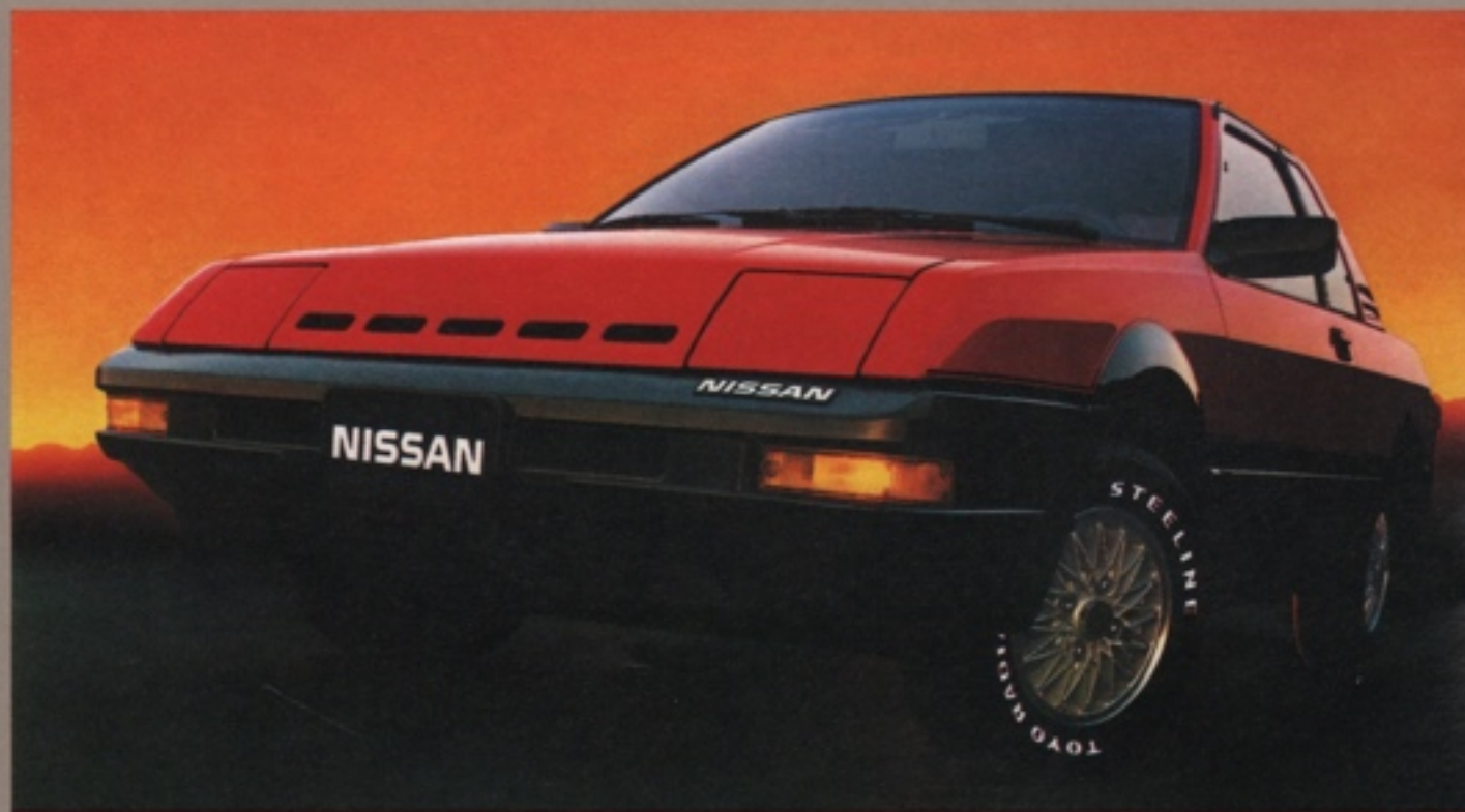
NISSAN PULSAR NX