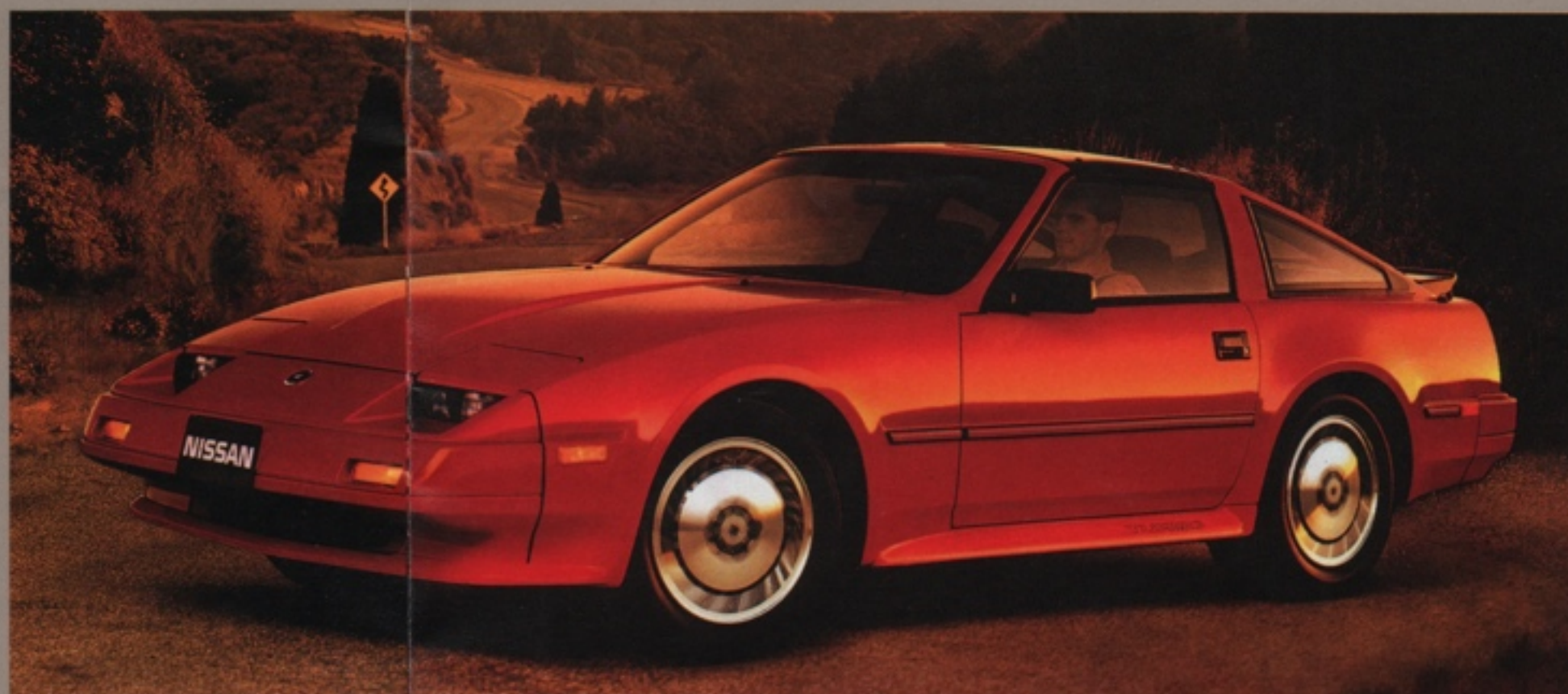
NISSAN 300 ZX TURBO