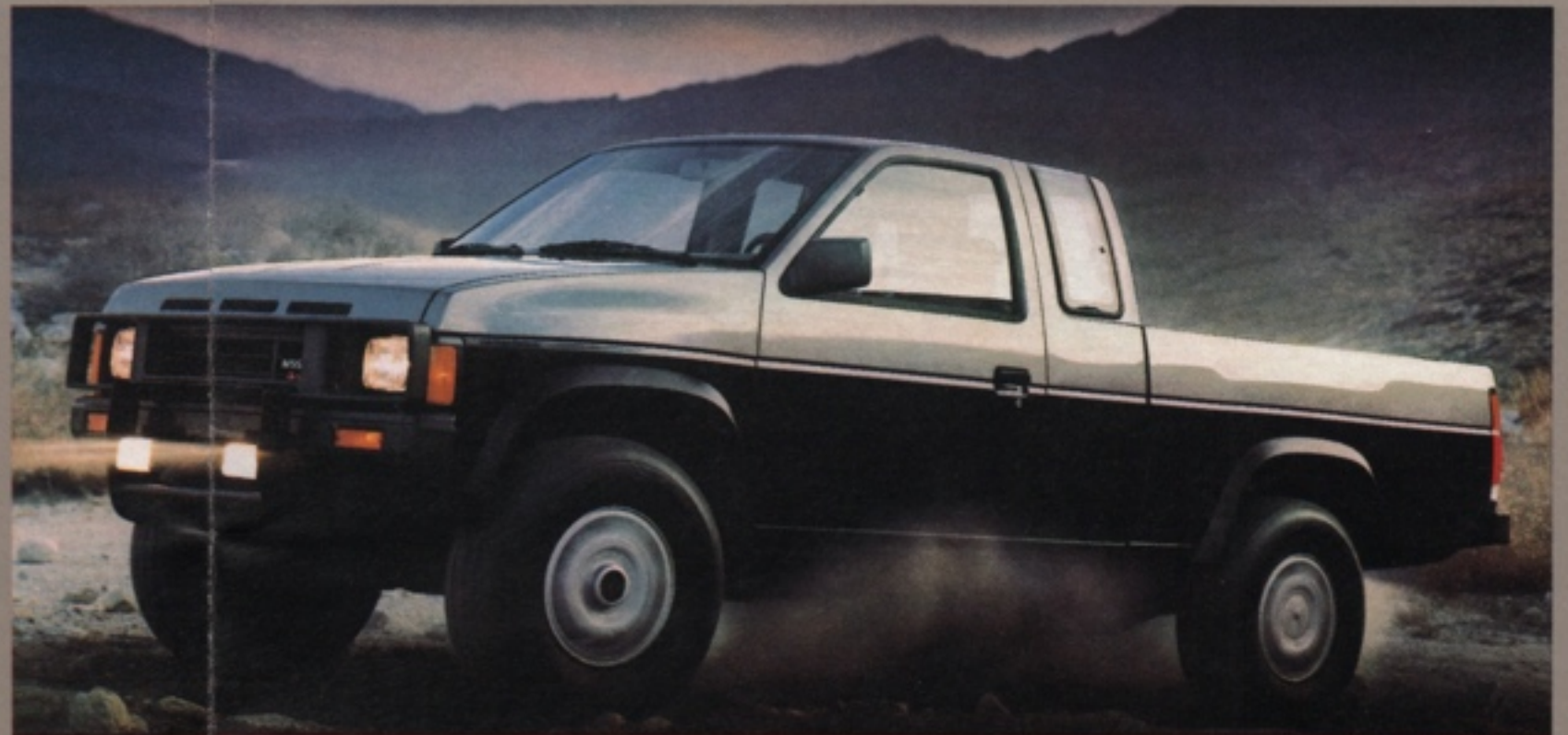
NISSAN SE KING CAB 4x4