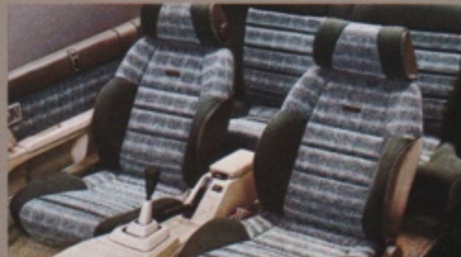
NISSAN 200 SX TURBO INTERIOR