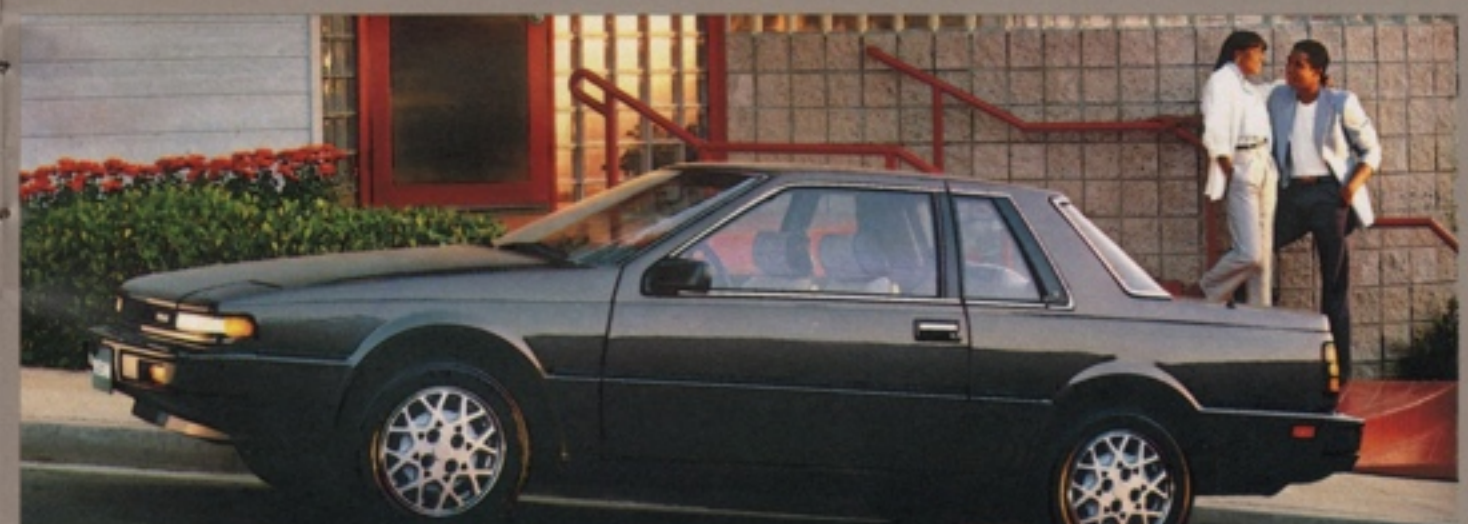
NISSAN 200 SX XE NOTCHBACK