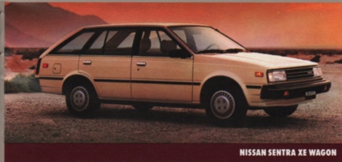
NISSAN SENTRA XE WAGON

Some items shown are optional. See the 1986 Nissan Sentra brochure for more complete information.