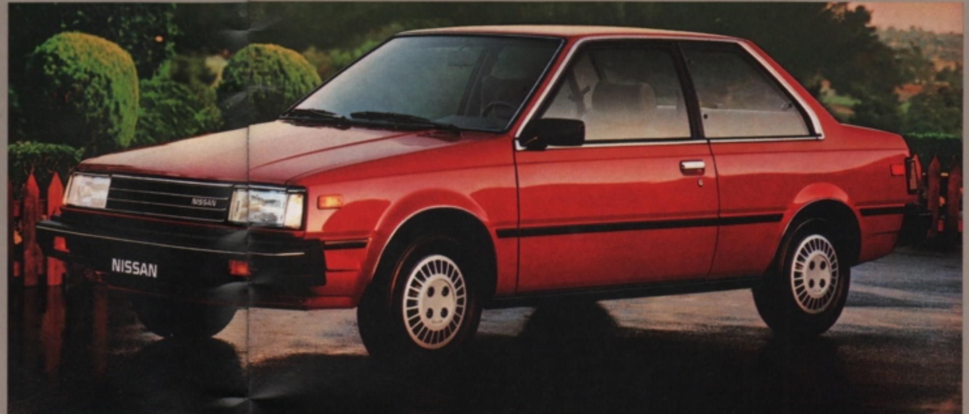
NISSAN SENTRA XE 2-DOOR SEDAN