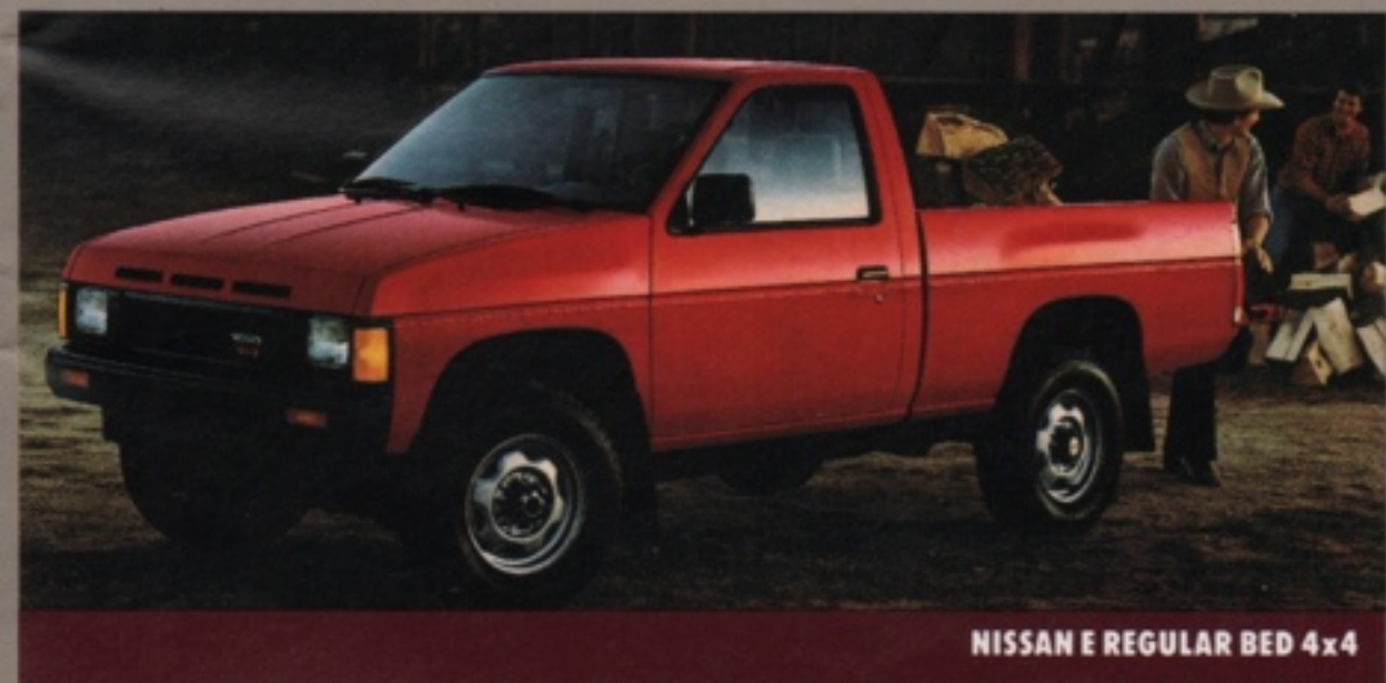
NISSAN E REGULAR BED 4x4