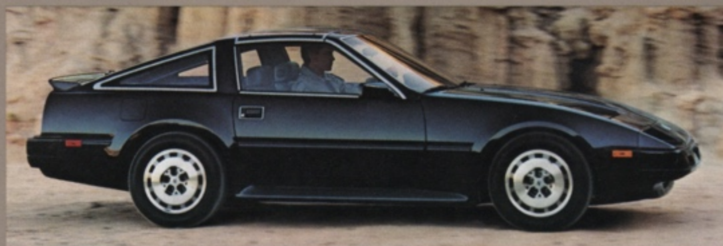
NISSAN 300 ZX 2-SEATER