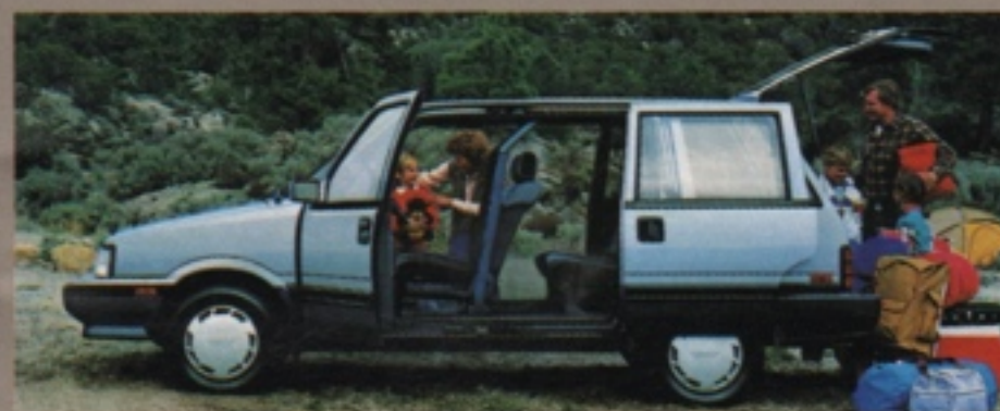
NISSAN STANZA 2-WHEEL-DRIVE WAGON