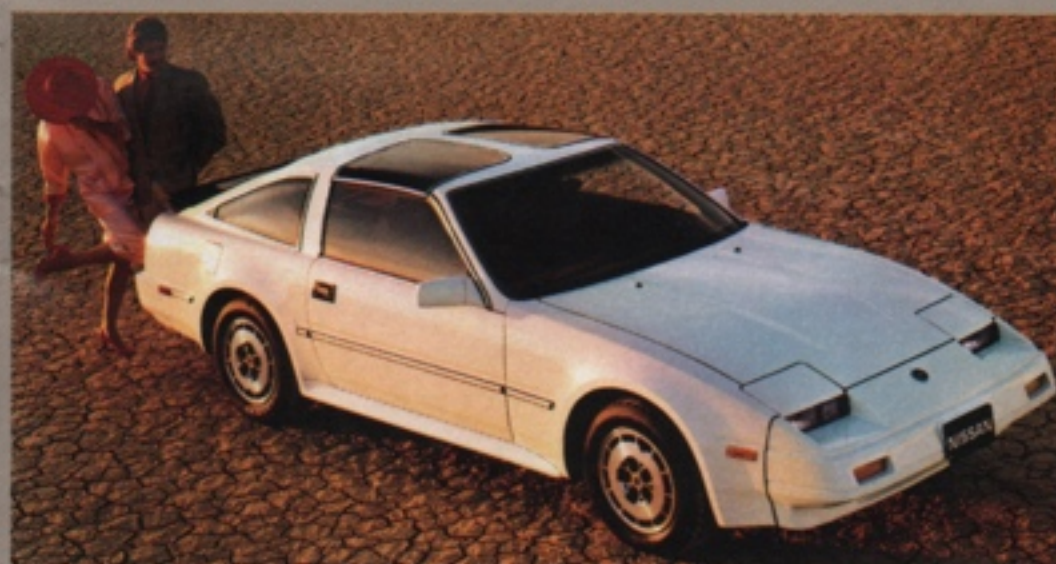
NISSAN 300 ZX 2+2