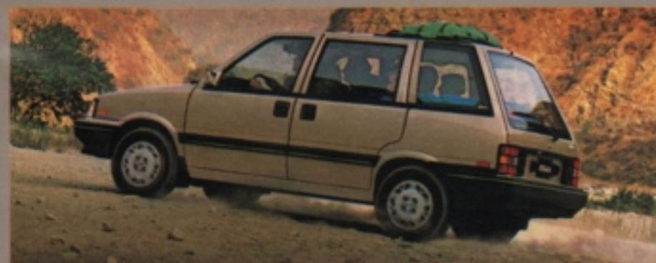
NISSAN STANZA 4-WHEEL-DRIVE WAGON